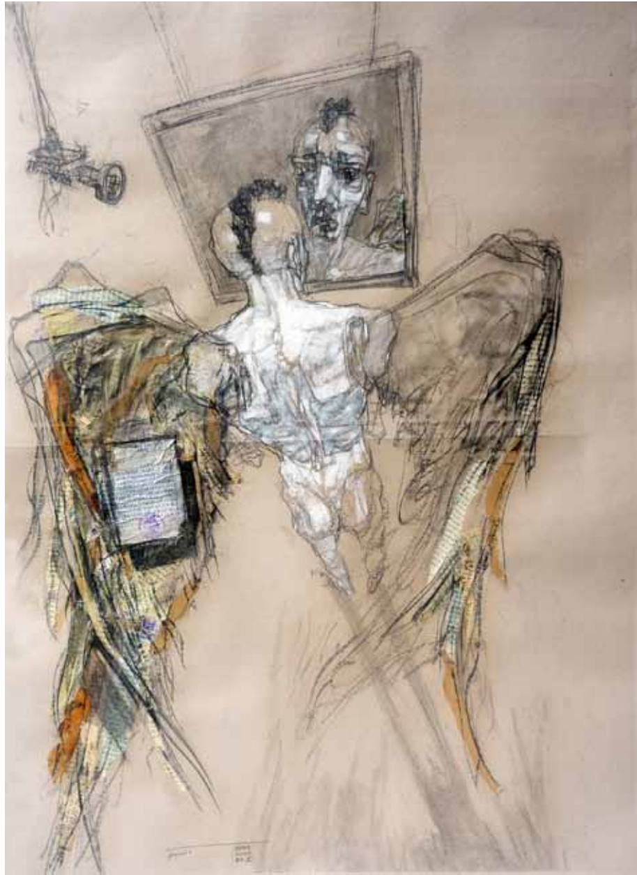
X PRIVACY (VIII), 2014 Mixed media, 140 x 100 cm