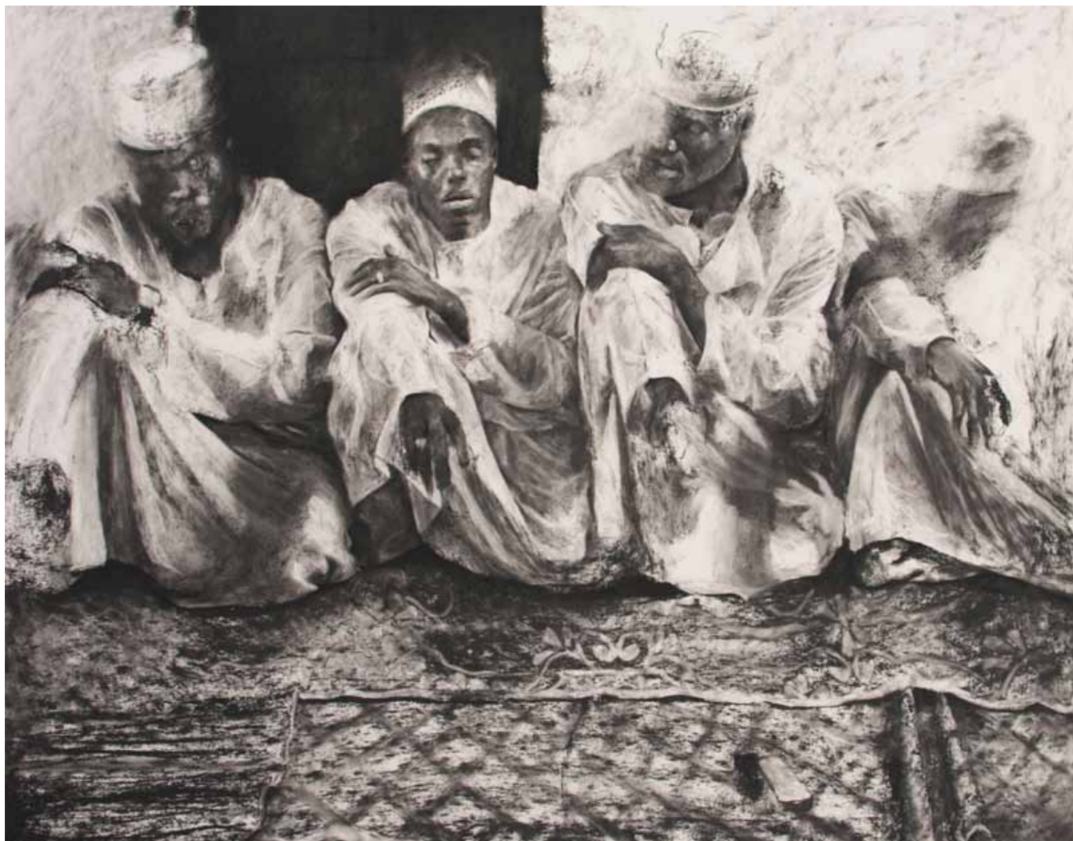
Shwari, 2014 Charcoal and granite on paper, 153 x 122 cm