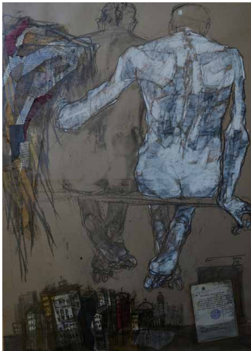
X PRIVACY (V), 2014 Mixed media, 140 x 100 cm