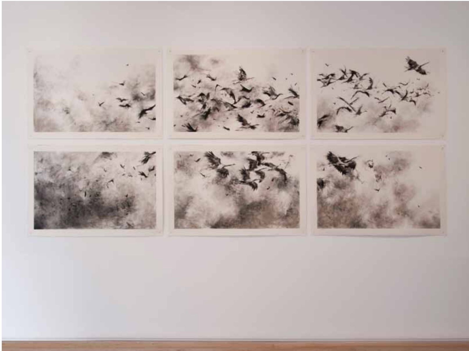
Wild Men Who Caught and Sang the Sun in Flight, 2014 Charcoal and granite on paper, 312 x 138 cm