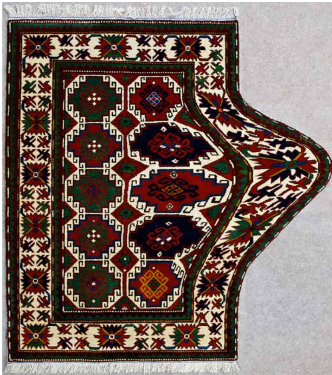
Carpet Collection: EXPANSION, 2011 Woolen handmade carpet, 150 x 100 cm