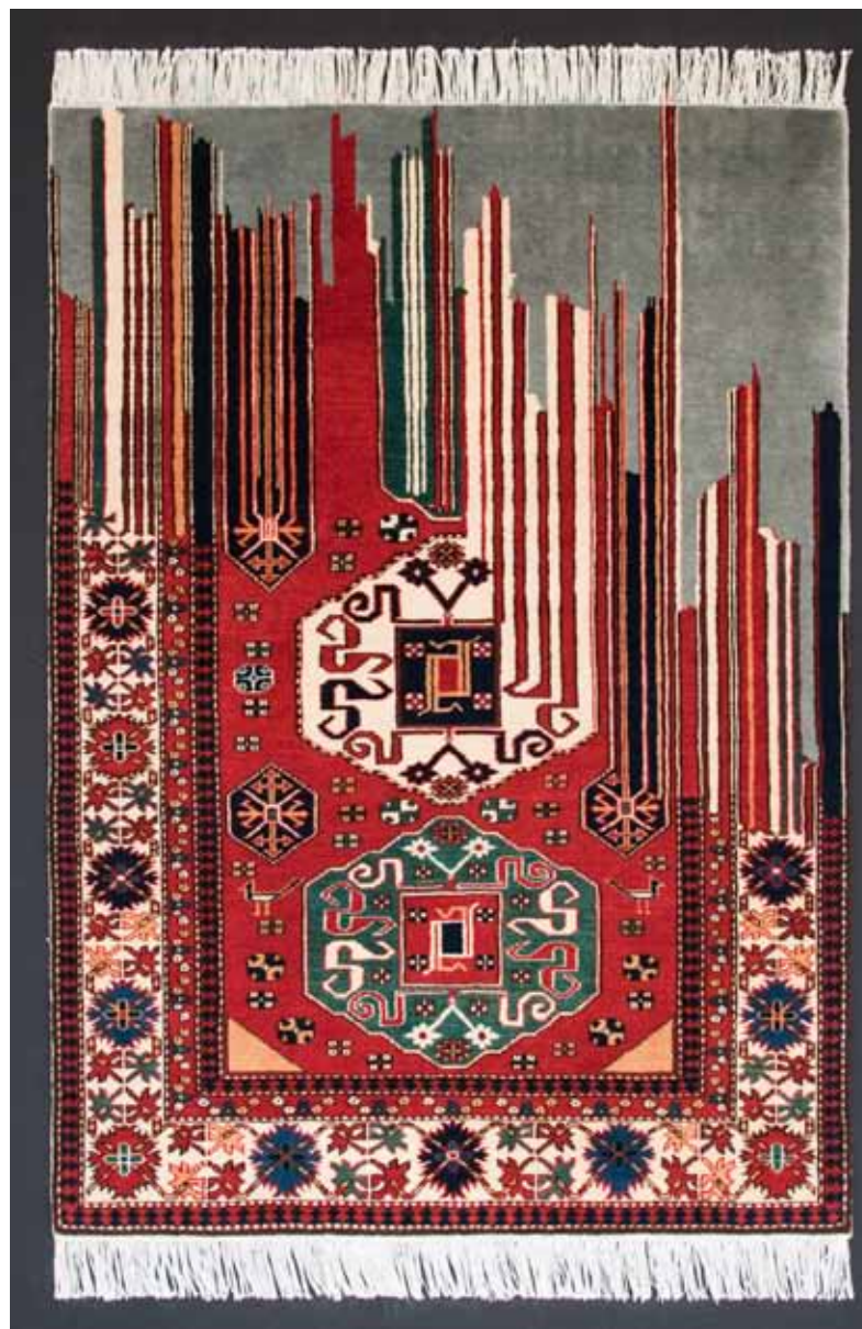
Carpet Collection: RESTRAINT, 2011 Woolen handmade carpet, 150 x 100 cm