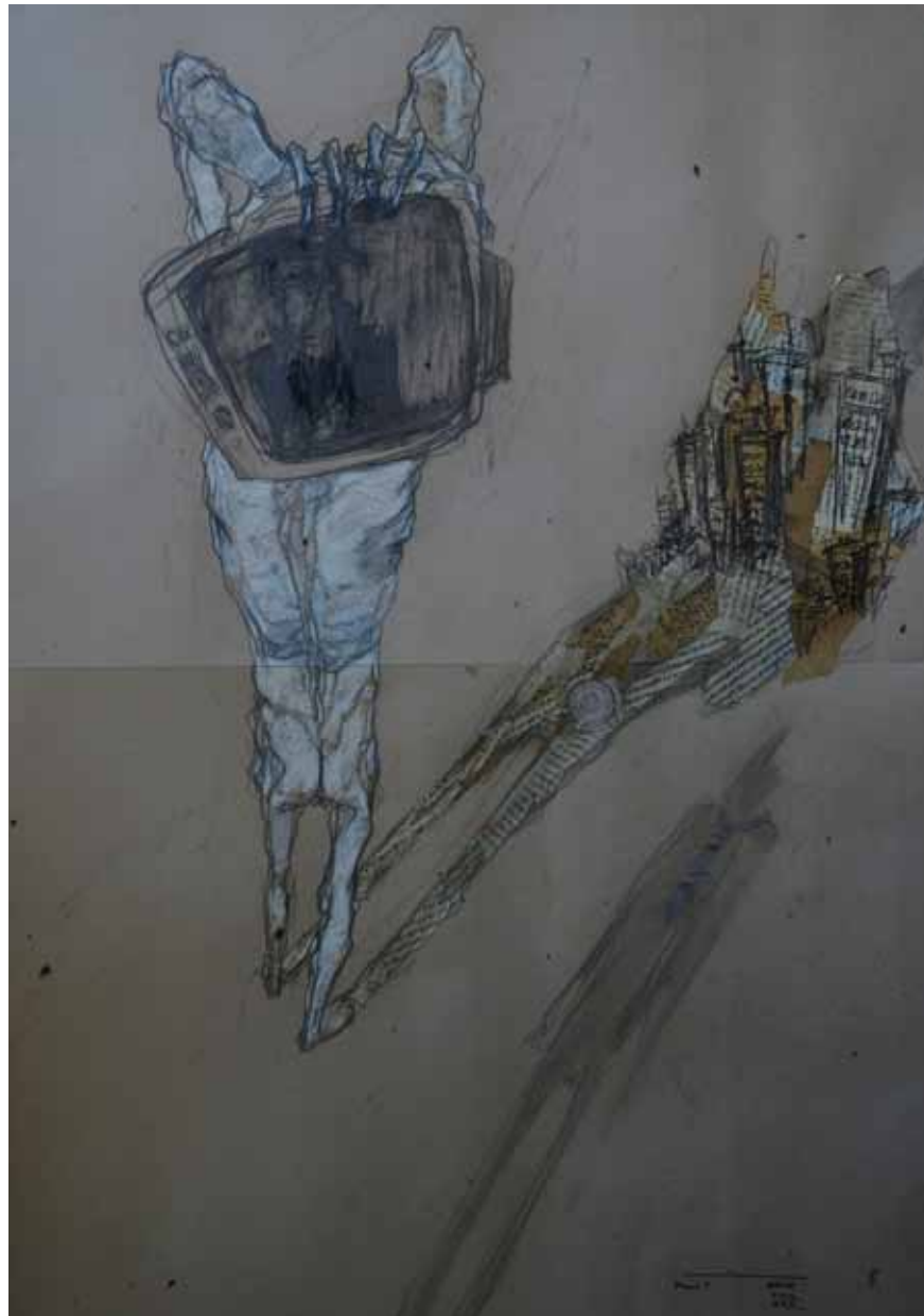
X PRIVACY (II), 2011 Mixed media, 140 x 100 cm