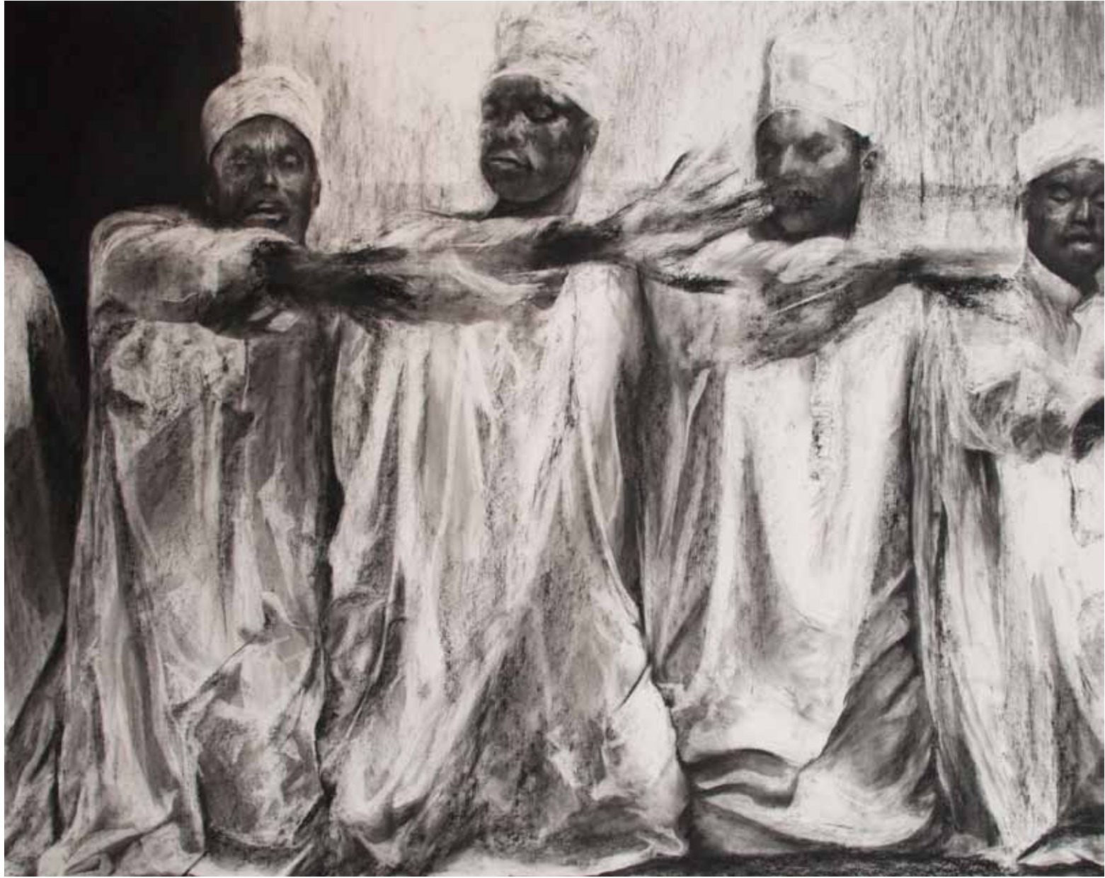
Damoni, 2014 Charcoal and granite on paper, 153 x 122 cm