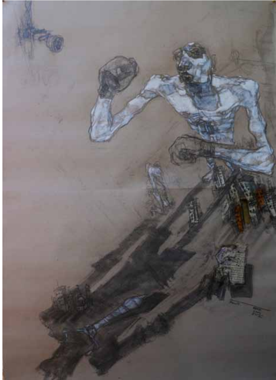
X PRIVACY (III), 2011 Mixed media, 140 x 100 cm