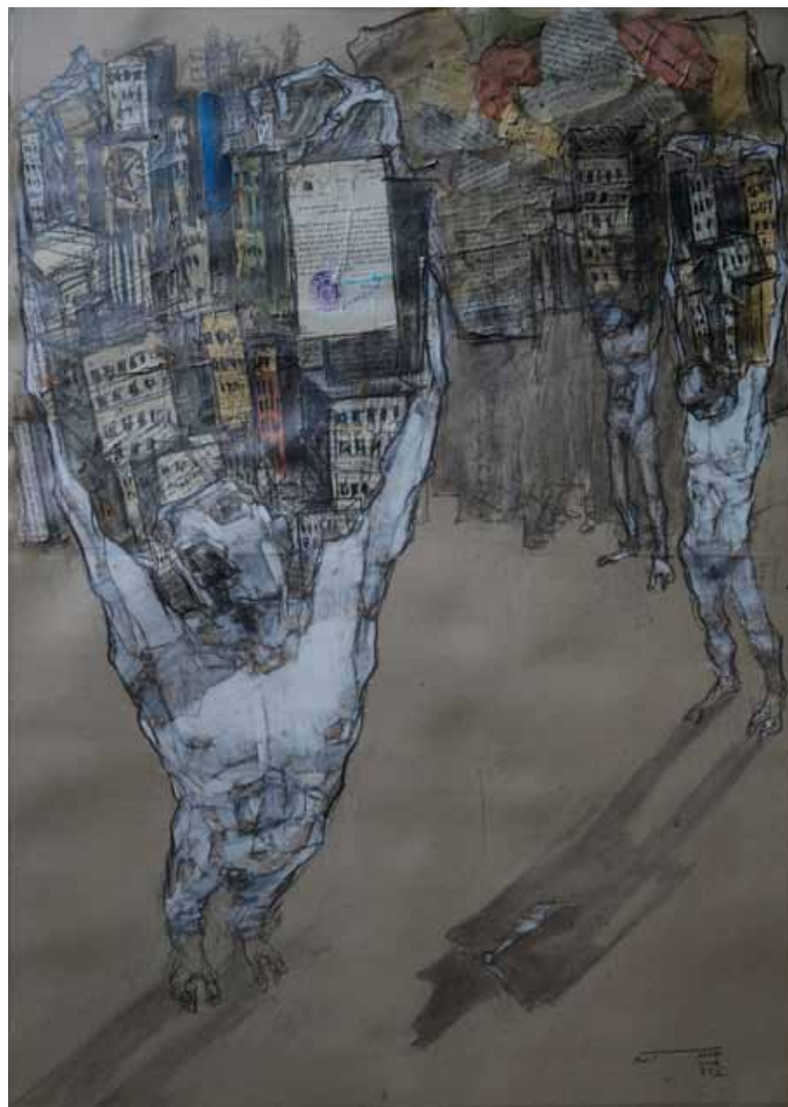
X PRIVACY (IV), 2014 Mixed media, 140 x 100 cm