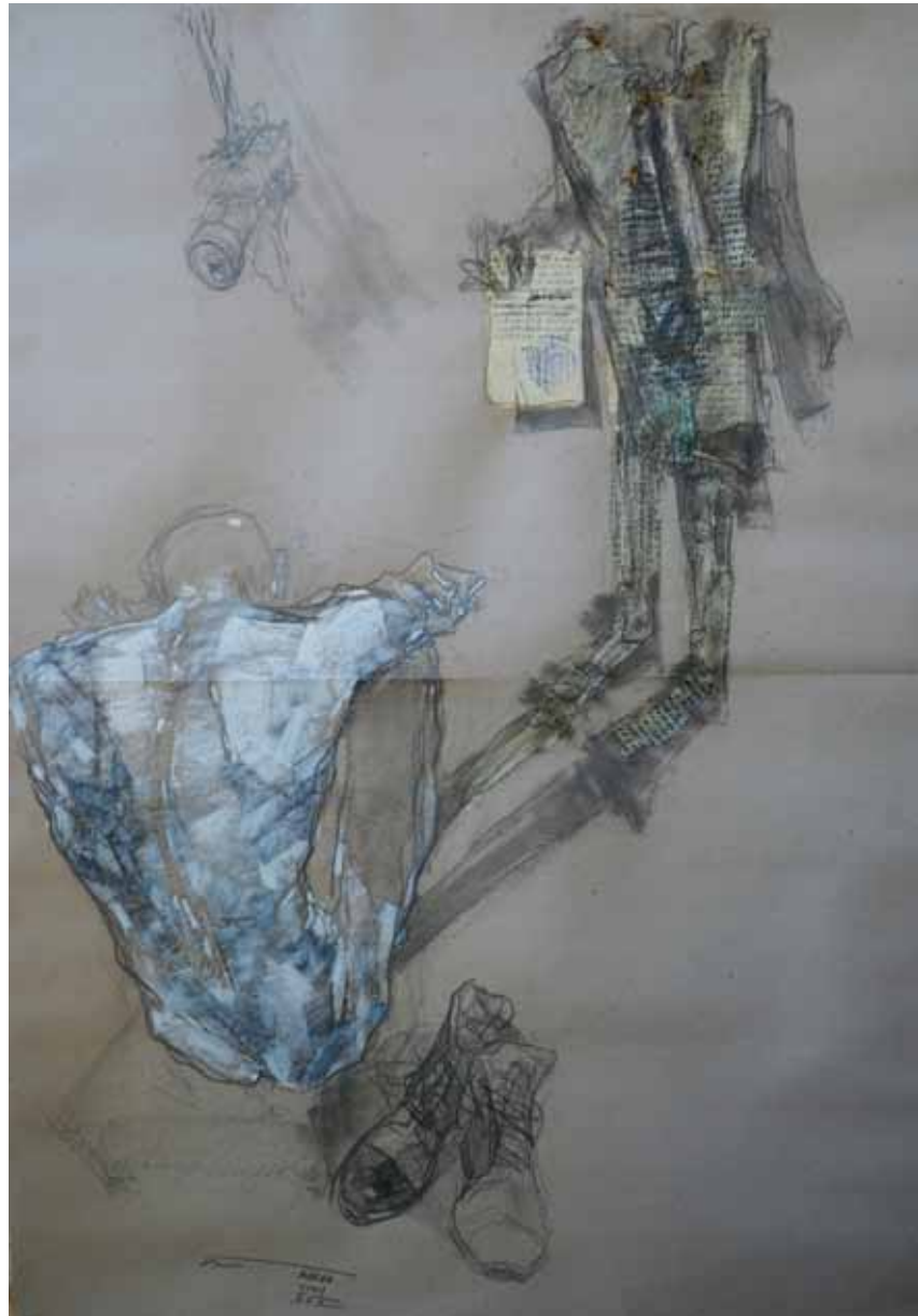
X PRIVACY (I), 2011 Mixed media, 140 x 100 cm