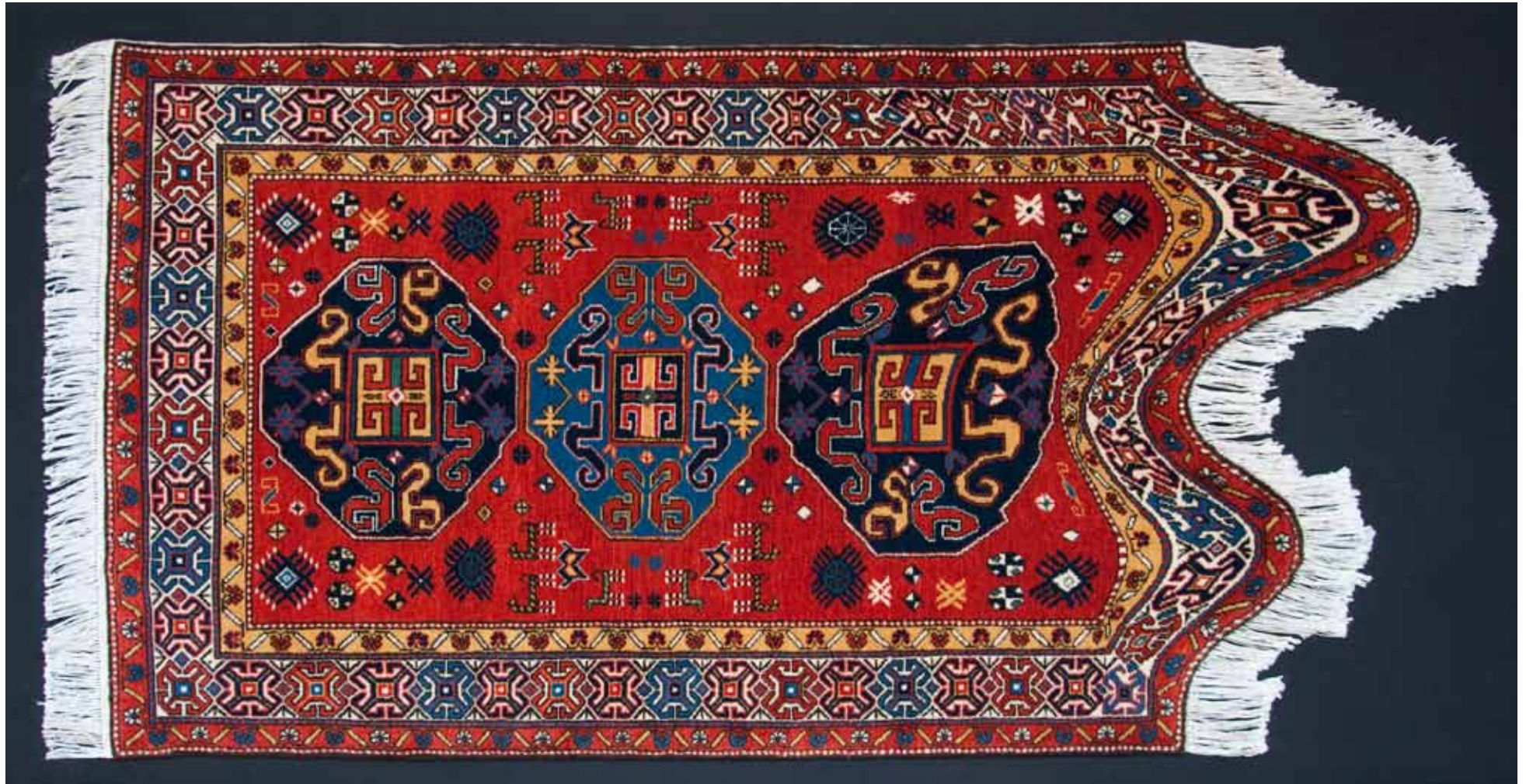
Carpet Collection: CHANGES, 2011 Woolen handmade carpet, 150 x 100 cm