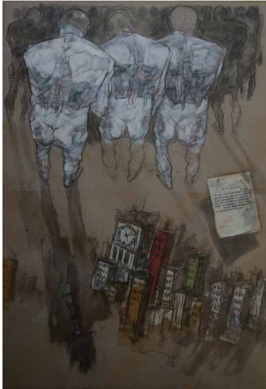
X PRIVACY (IX), 2014 Mixed media, 140 x 100 cm