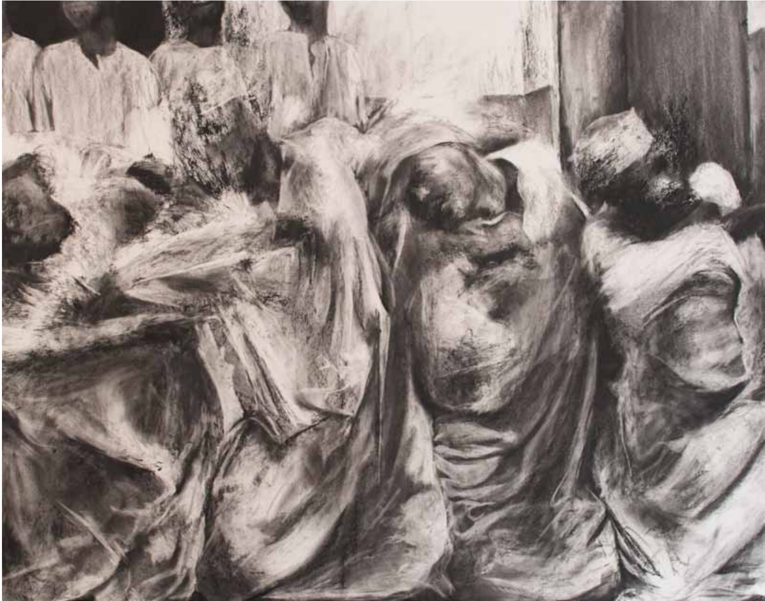
Marama, 2014 Charcoal and graphite on paper, 153 x 122 cm