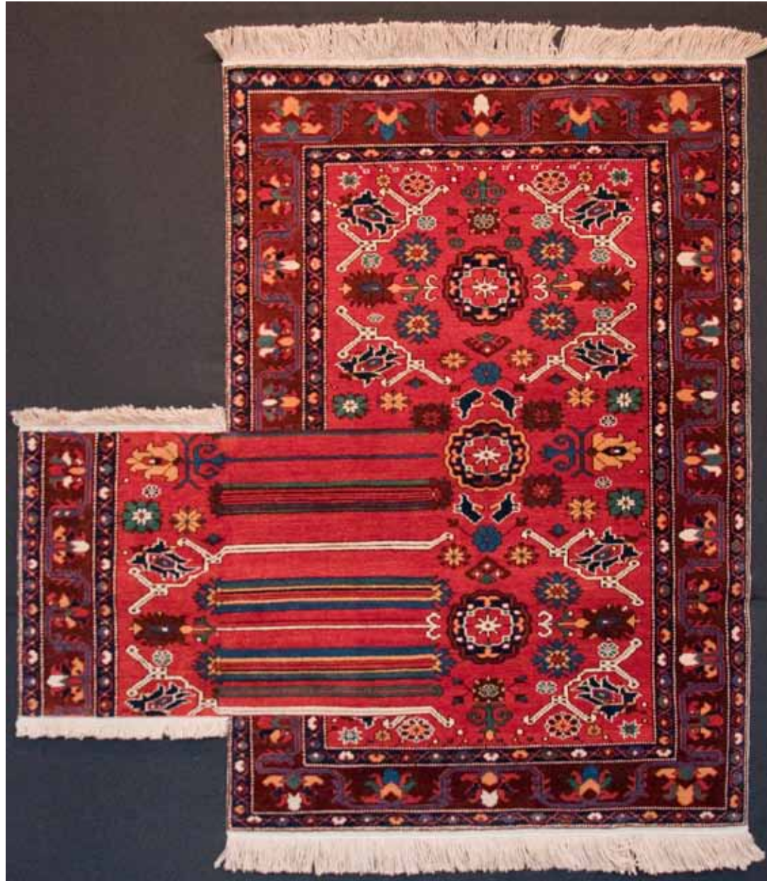
Carpet Collection: SPREADING, 2013 Woolen handmade carpet, 165 x 145 cm