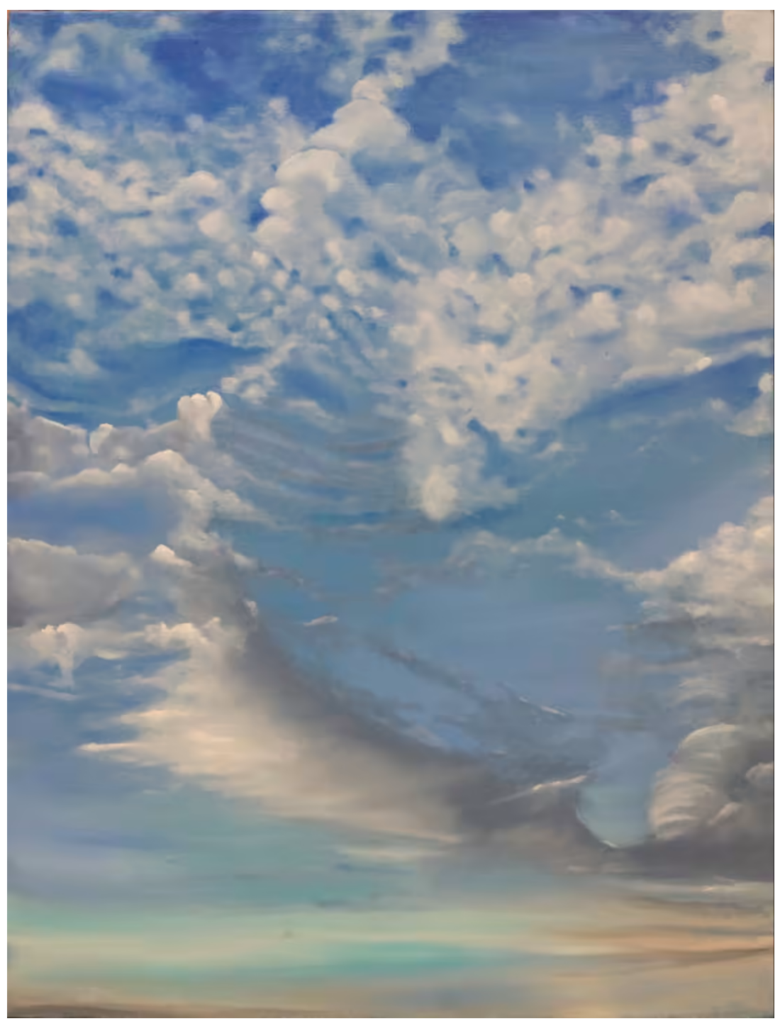
'Untitled' (2021) by Ayesha Sultana © Courtesy the artist and Samdani Art Foundation

Tucked under the grand piano is a decomposing corpse made of buffalo hide, "Lost and Found" (2012) by Pakistani artist Huma Mulji; by the lift are sculptures from Venetians , Polish sculptor Paweł Althamer's 2013 Venice Biennale installation; the Samdanis acquired the two Bangladeshi figures from the series of 90. Other pieces are in their office or storage, many waiting to be displayed at Srihatta, the cultural centre they are building in Sylhet, the north-eastern city where their families originate. It will have an exhibition and residency space and 100-acre sculpture park designed by Aga Khan architecture award nominee Kashef Mahboob Chowdhury and will be completed this year.