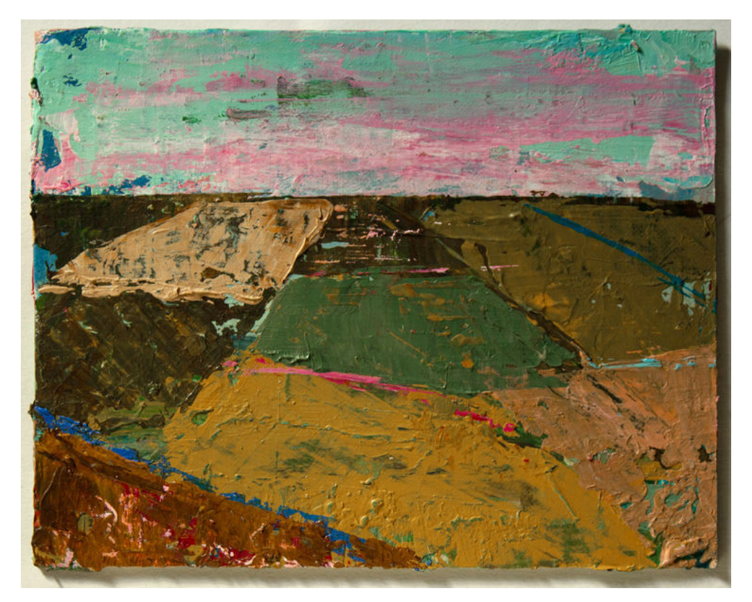
CHARLIE DAY – Evening Light, Felbrigg – Acrylic on found board, 13×16cm