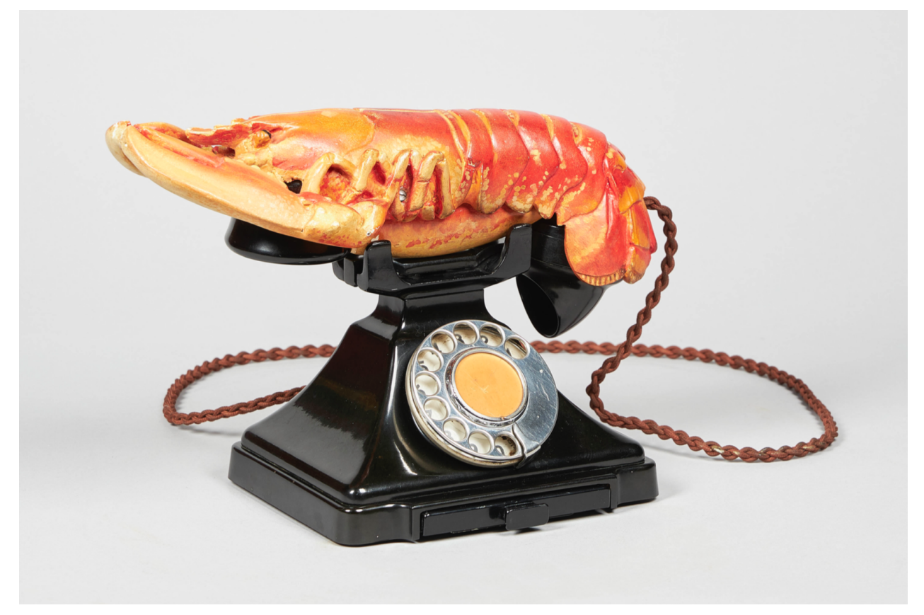
Image: Salvador Dalí,Lobster Telephone, 1938. Photo West Dean College of Arts and Conservation. © Salvador Dalí, Fundació Gala. Salvador Dalí, DACS 2022

Price: £18.50/16.80 (with/without donation). Concesions available