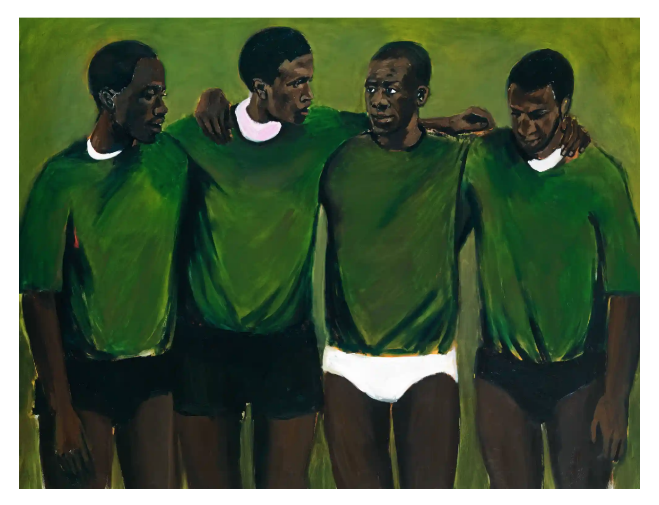
A guide to must-see exhibitions in London ending in February 2023.

Don't miss the opportunity to witness exceptional art before it's gone. Our guide features the must-visit exhibitions ending in February, including Lynette Yiadom-Boakye's solo show at Tate Britain and an exhibition focussed on surrealism at the Design Museum.