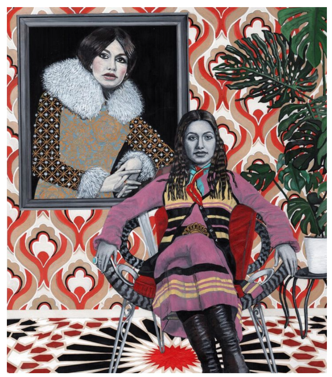
Image: The Love Addict (Portrait of Googoosh), 2019 © Soheila Sokhanvari. Courtesy of the artist and Kristin Hjellegjerde gallery.

#FLODown: Rebel Rebel is the inaugural major UK commission by renowned Iranian artist Soheila Sokhanvari. The exhibit pays tribute to pre-revolutionary Iran's feminist icons, transforming the Curve into a sacred space filled with stunning miniature portraits of Iranian cultural figures. The works explore the conflicting experiences of Iranian women from 1925 to the 1979 revolution - a time of both liberation and commodification that was fleeting. The exhibit is accompanied by a specially composed soundtrack from Marios Aristopoulos and features songs from iconic Iranian singers of the period. Location: Silk St, Barbican, London EC2Y 8DS.