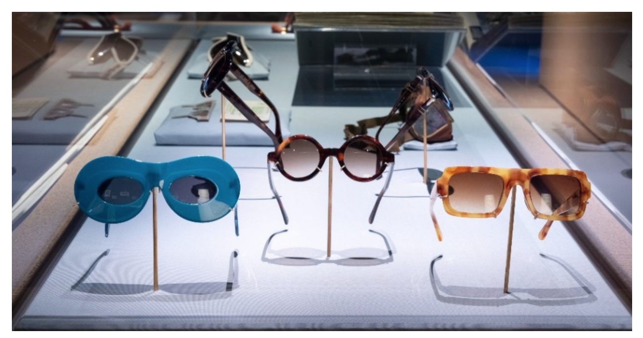
Image: GB. London. Wellcome Collection. In Plain Sight exhibition. 2022. CC BY-NC

#FLODown: In Plain Sight explores the different ways we see and are seen by others. It questions the central place that sight holds in human society through the different experiences of sighted, partially sighted and blind people. In the UK, more than 2 million people live with sight loss and 69% of the population wear corrective eyewear or have had laser eye surgery, according to figures from the NHS. The exhibition will feature eyewear from the 1600s to the present day, reflecting on evolving design innovations and style, as well as contemporary artworks and commissions, and historical and scientific material investigating visual perception. Location: 183 Euston Road, NW1 2BE.