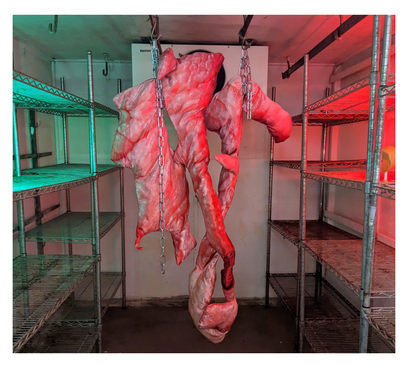
Meat Market #1 @ 31 Tanners Hill, Deptford

A disused butcher's shop has been turned into the first of a two-parter exhibition, curated by Sophie Nowakowska, that makes full use of the quirks of the space – with a creepy over-sized hare in the cramped attic space and pieces hanging like meat in the walk-in fridge. It's a clever use of the space filled with some fantastic artworks. Until 21 May. (Part #2 will run 25 May -4 June).