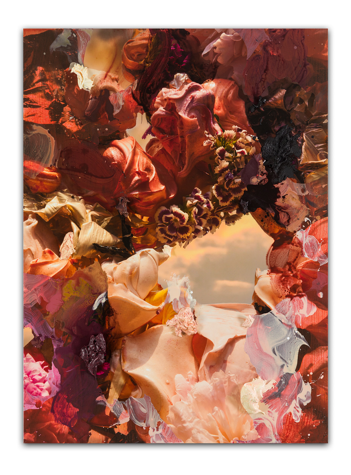
Birch Maple Oak Post Rococo #9, 2023 Acrylic and pigment on canvas, 41 x 30 cm, 16 1/8 x 11 3/4 in

The warm golden, red and peachy tones of this latest series are the result of both a particular light quality and environment. Nevertheless, the resultant works, in their shifting, shimmering hybridity, still manage to evade the trap — or is it deception? — of