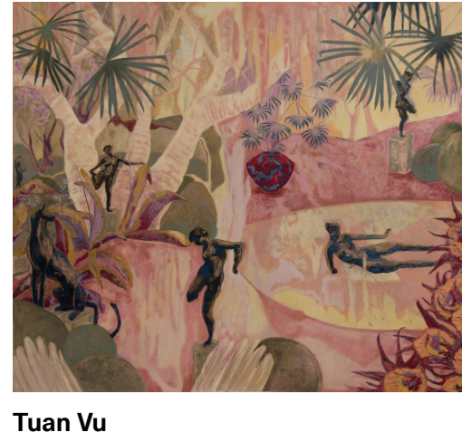
Norton Simon Garden, 2023 Oil and oil sticks on canvas 150 x 180 cm, 59 x 70 7/8 in