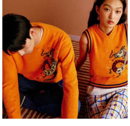
ART + CULTURE 10 Statement-Making Gifts to Celebrate the Year of the Dragon