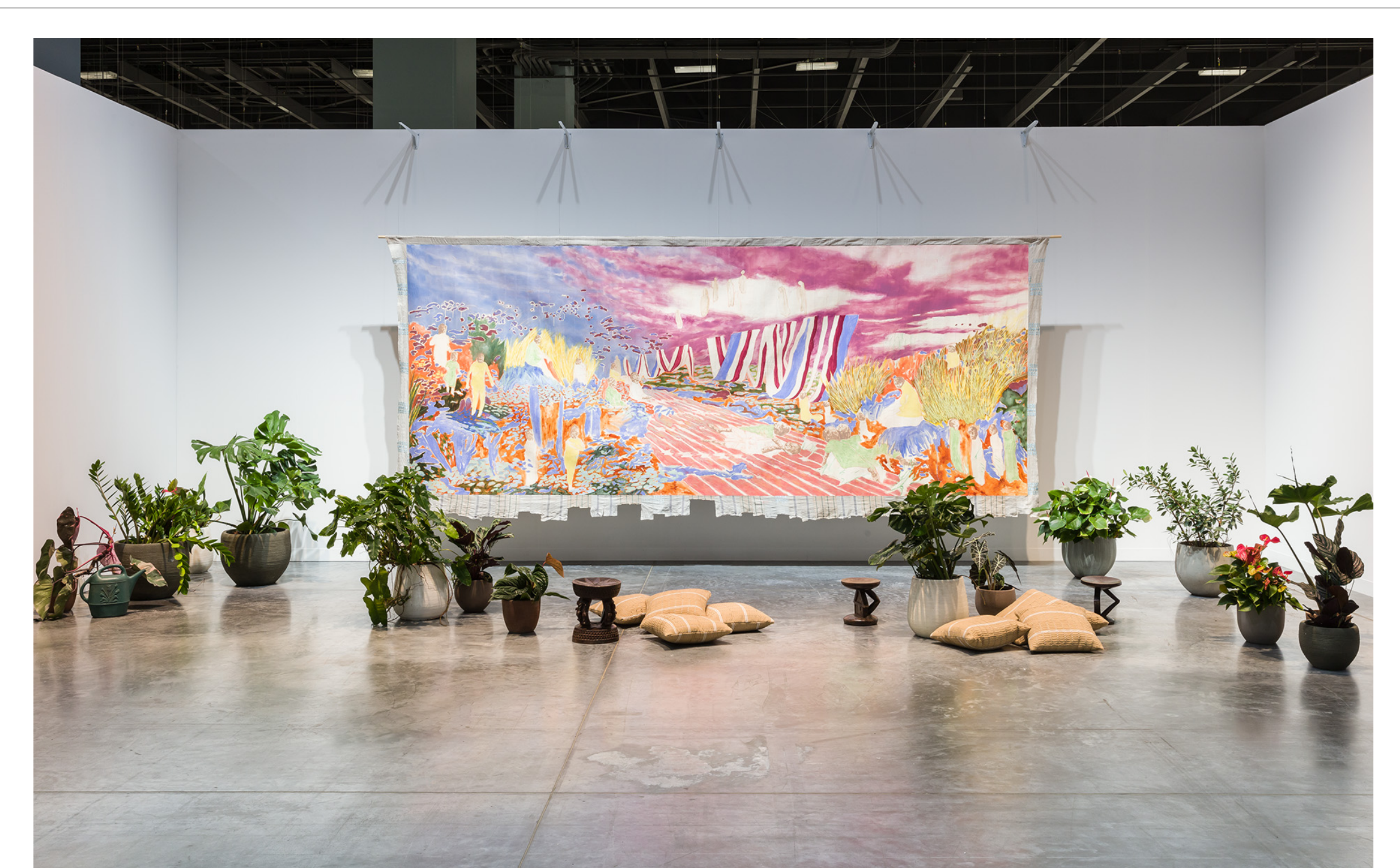
Installation view of Nengi Omuku's work at Art Basel Miami 2022.