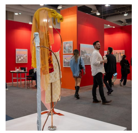
ART + CULTURE 5 Must-See Artworks at ZonaMaco 2024