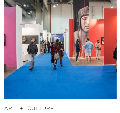
Discover Mexico City's Thriving Art Scene