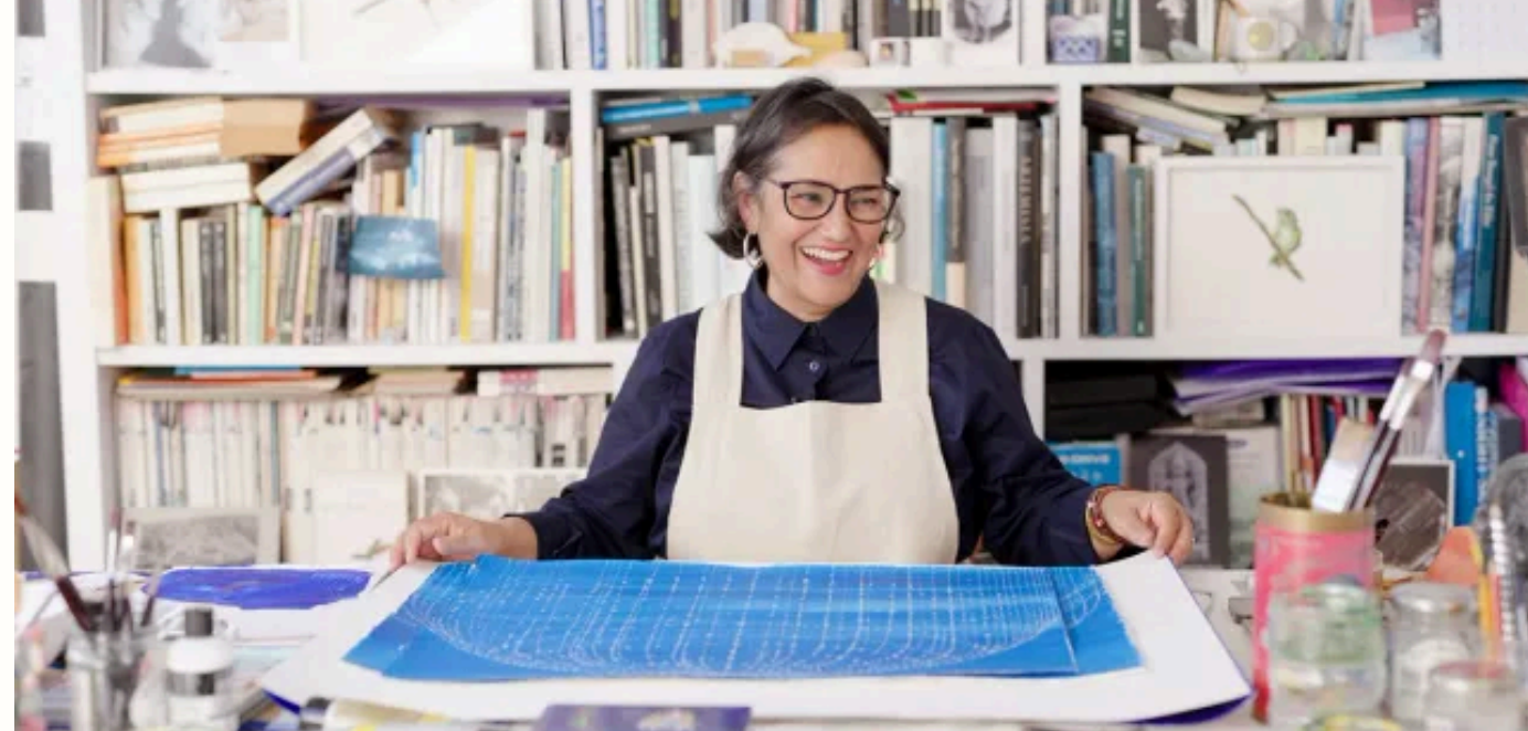
Sutapa Biswas is one of the artists supporting Hospital Rooms' Digital Art School

Online sessions will be led by artists such as Sutapa Biswas and Sarah Dwyer