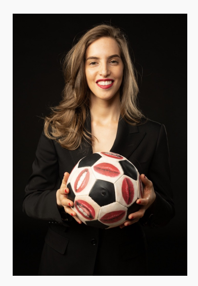
Spotlight artist Noa Klagsbald