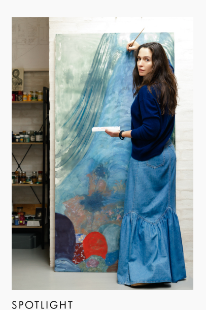
Spotlight artist Veronica Smirnoff