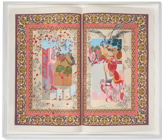
Shahzia Sikander's The Explosion of the Company Man (2011) Private Collection, London / Karachi

Other Royal Collection items seen for the first time include a gold painted page of Persian verse, written by Nizami, an epic poet in Persian literature and an illustrated copy of the Ishqnama (Book of Love) a manuscript containing 104 illustrations commissioned during the reign of the last King of Awadh, Wajid Ali Shah (reign, 1847-56).