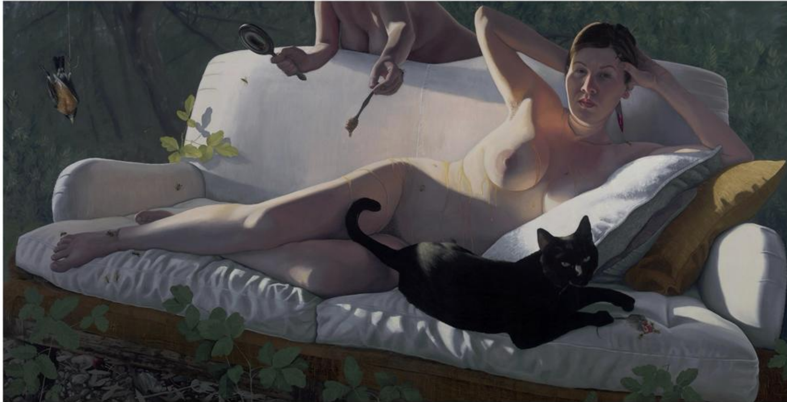
There is Shadow Under the Golden oil on linen, 36 x 72 inches