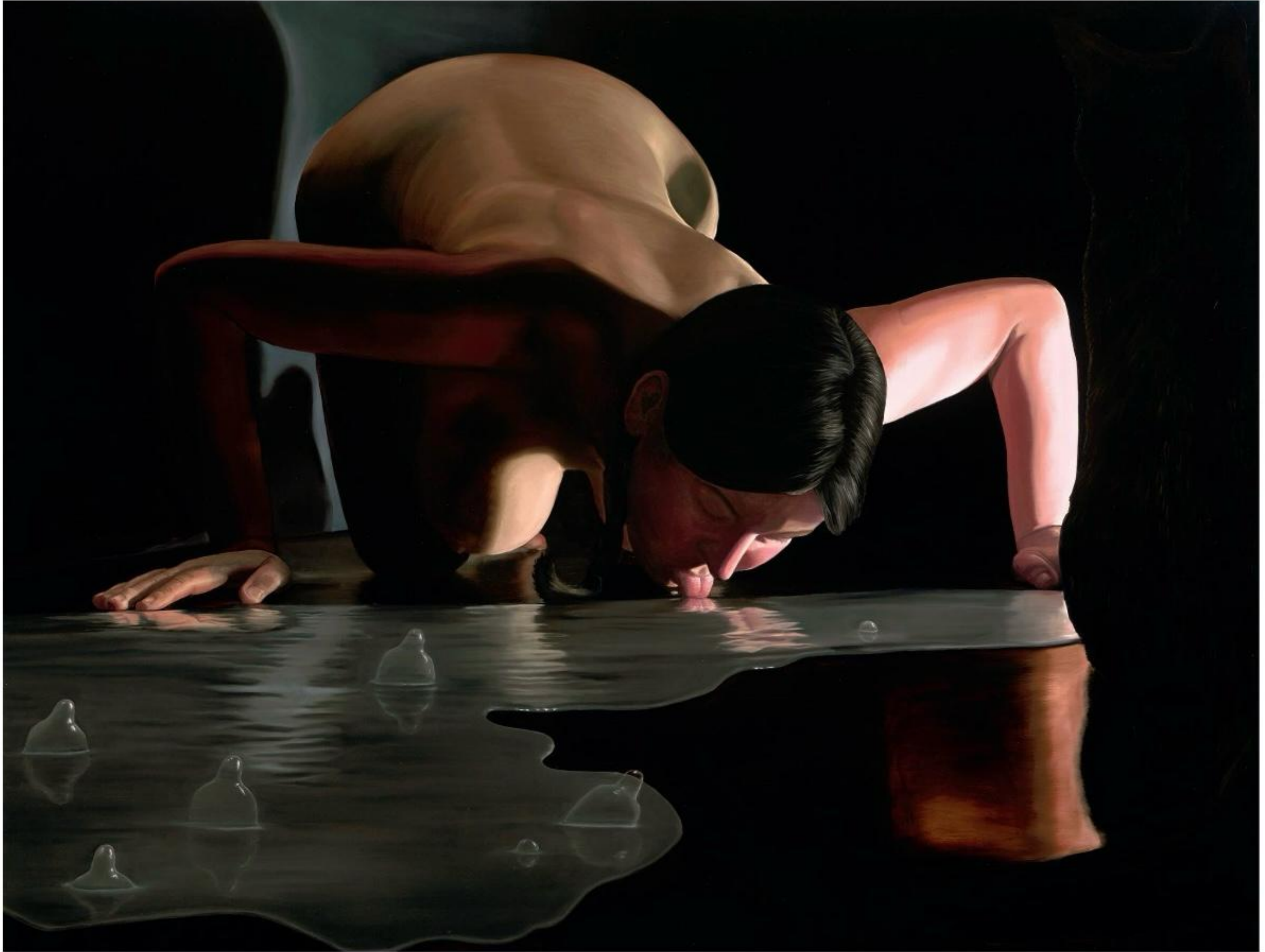
At the Event Horizon oil on linen, 36 x 48 inches