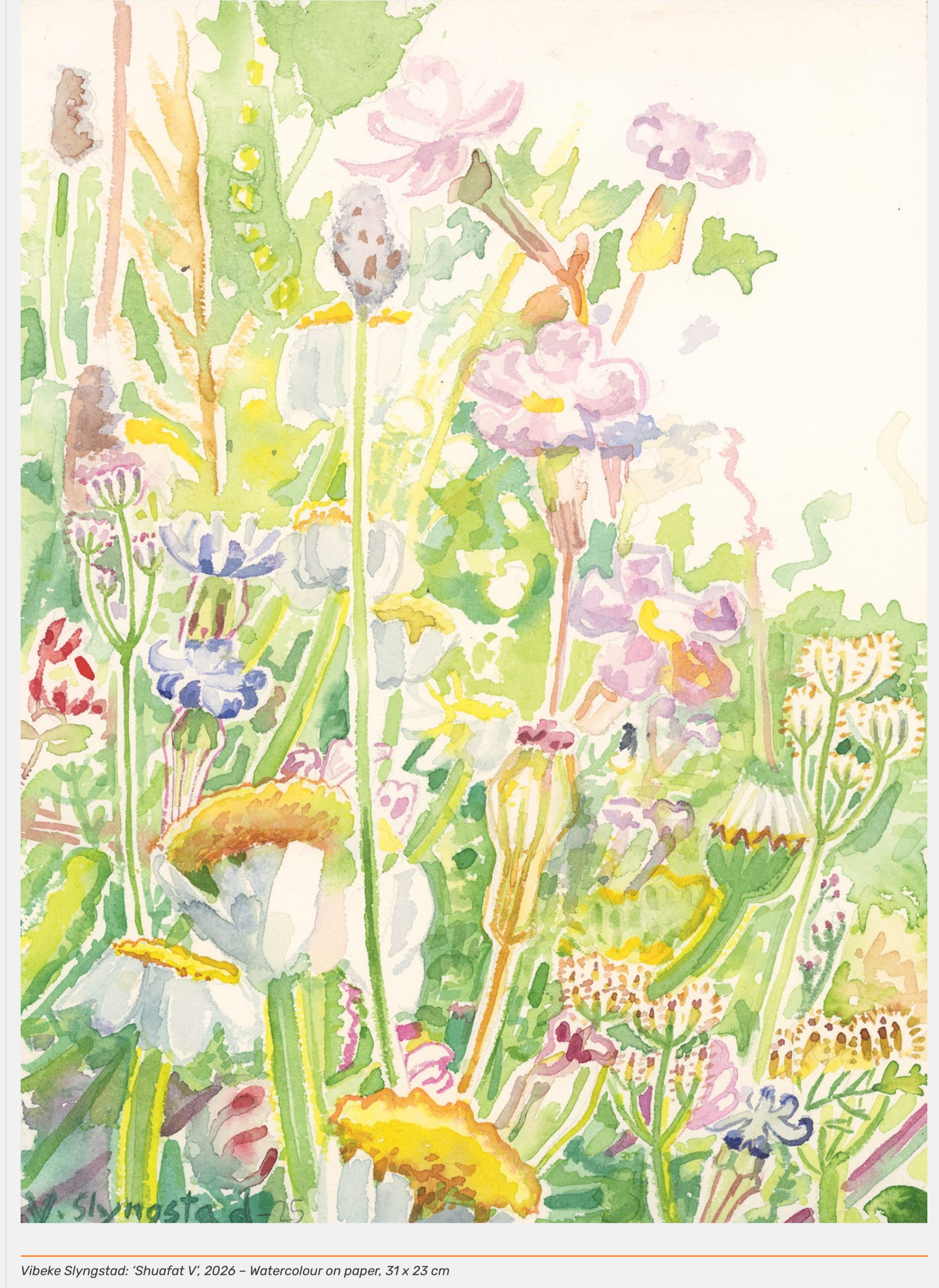
Vibeke Slyngstad: 'Shuafat V', 2026 – Watercolour on paper, 31 x 23 cm

Drawing Room. Unit 1b New Tannery Way, Bermondsey, London, SE1 5WS drawingroom.org Instagram: @drawingroomlondon