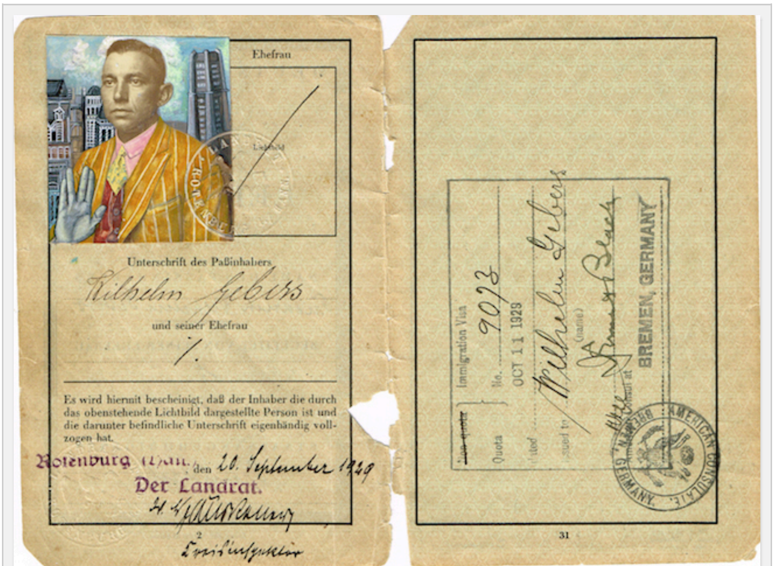
Soheila Sokhanvari, 'We Come in Peace', 2016, egg tempera on vintage passport (dated 1929).

The second edition of the Iran Contemporary Art Biennale brings together paintings, photographs, installations and video art highlighting peace, not war.