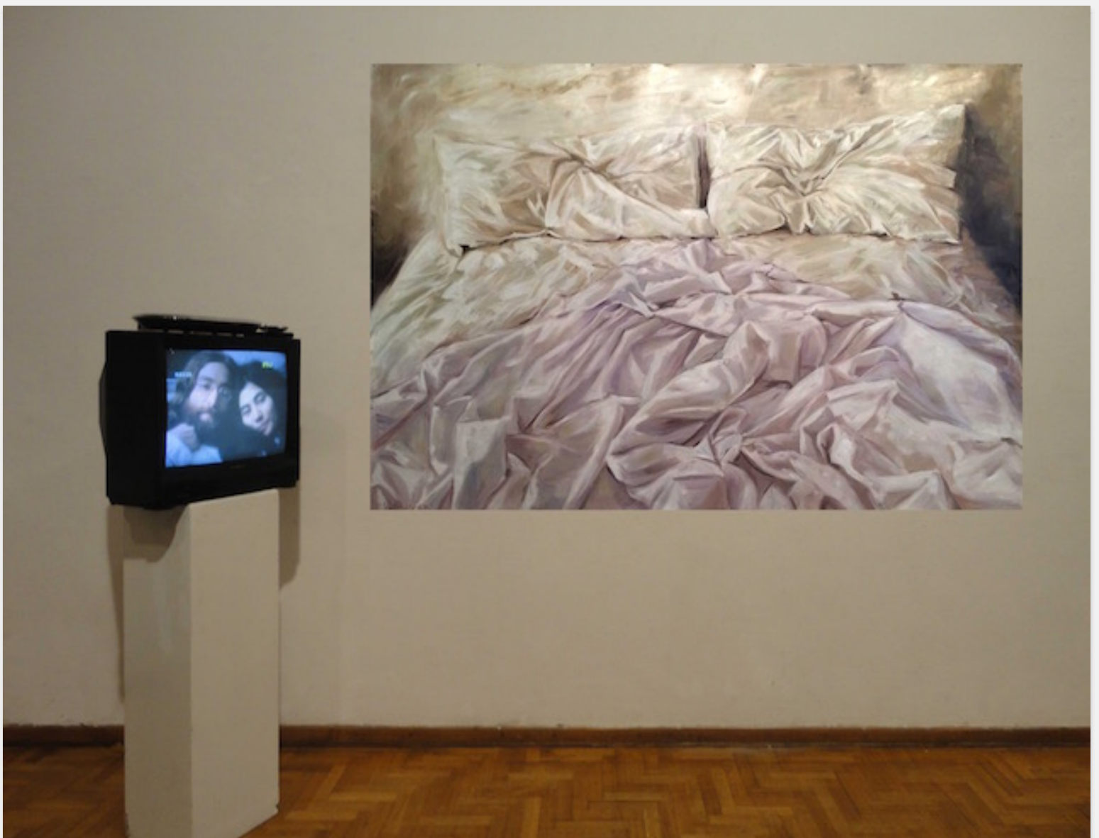
Shadi Noyani, 'Bed Peace' , 2016, oil on cardboard, 150 x 220 cm. Image courtesy the artist and ICA Biennale.

These individual connections in turn provide an outlet for understanding each other at the most fundamental level and seek to open up a new narrative around war, conflict and injustice through cooperation and “understanding what creates a culture of human society”.