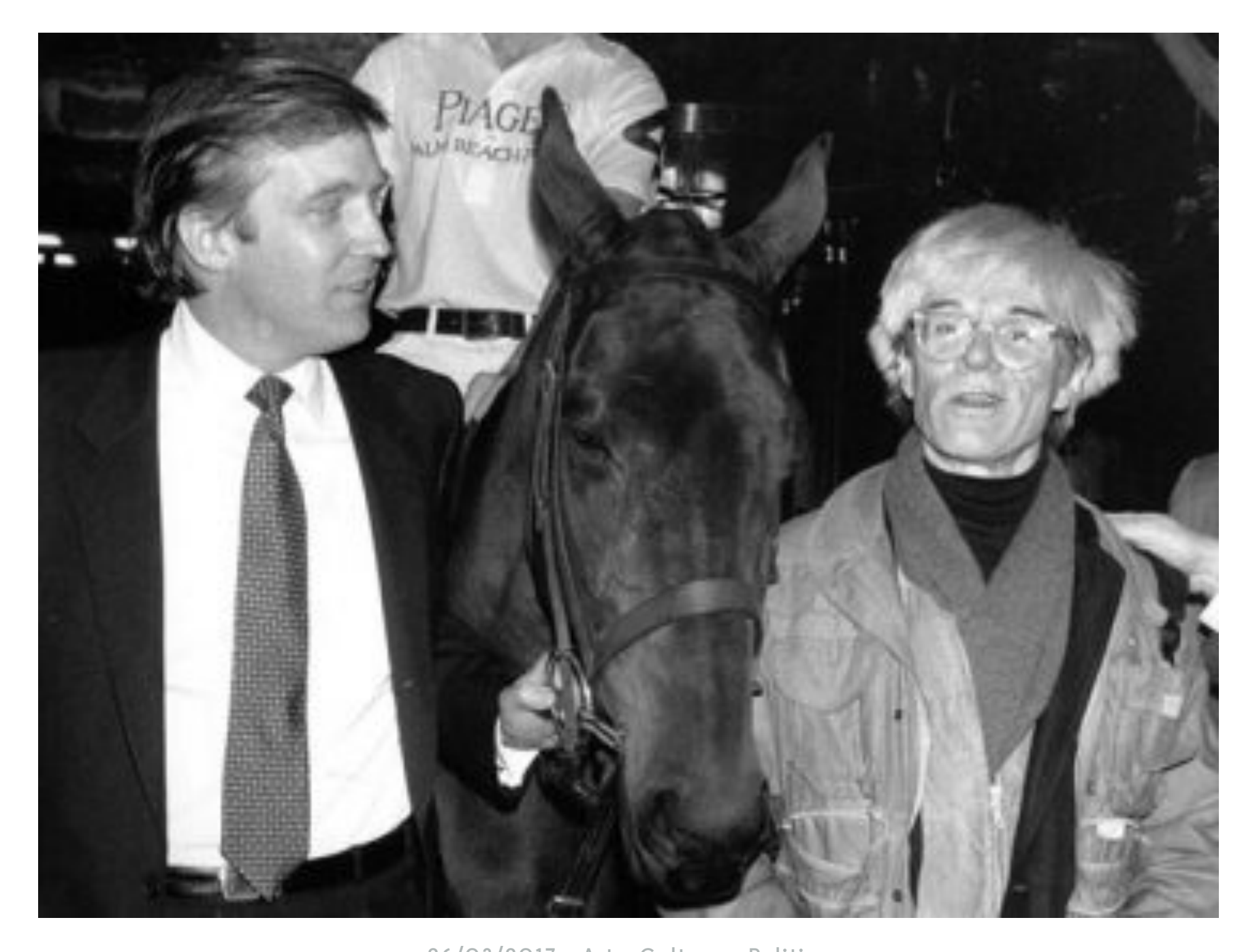
26/03/2017 · Art · Culture · Politics