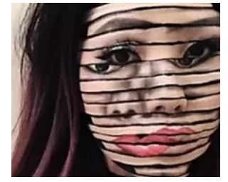
Makeup Artist's Work Takes Optical Illusions To The Next Level

(http://www.freeadvisor.co.uk/be$bttppldarysa%.freeadvisor.co.uk/be$bttpbar/hithsaw.goodmad.com/3662411/makeup-