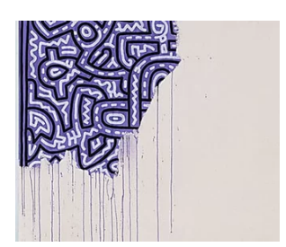
The Haunting Last Paintings Of Famous Artists