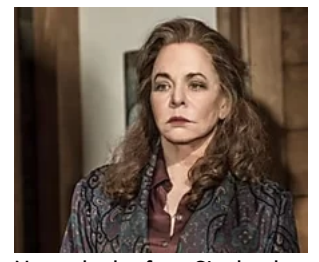
No apologies from Stockard Channing's boomer mum The Telegraph