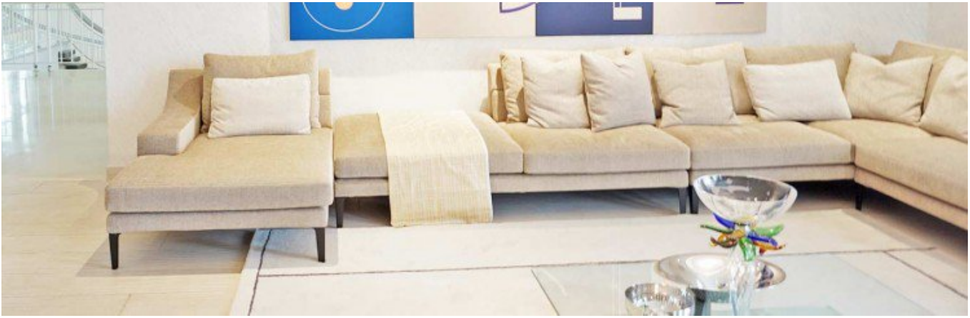
Tabuh Tabuhan in Sapphire, Linen, Violet and Prussian - Screen (Colin McPhee), 2017, by Sinta Tantra.

The artist introduces two different styles in her solo exhibition: one is bright and colorful, channeling the sights and smells McPhee recalls in A House in Bali , such as landscape and temple offerings.