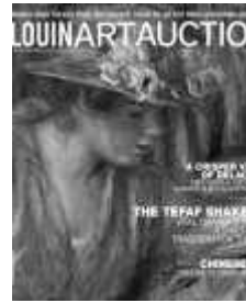
Art + Auction