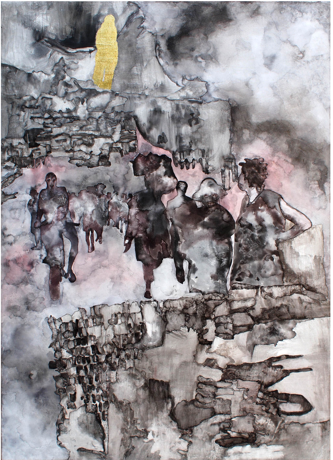
Flashback: Be Still and Know , in ink, charcoal and oil bar, is part of the series called The Burst by Florine Demosthene