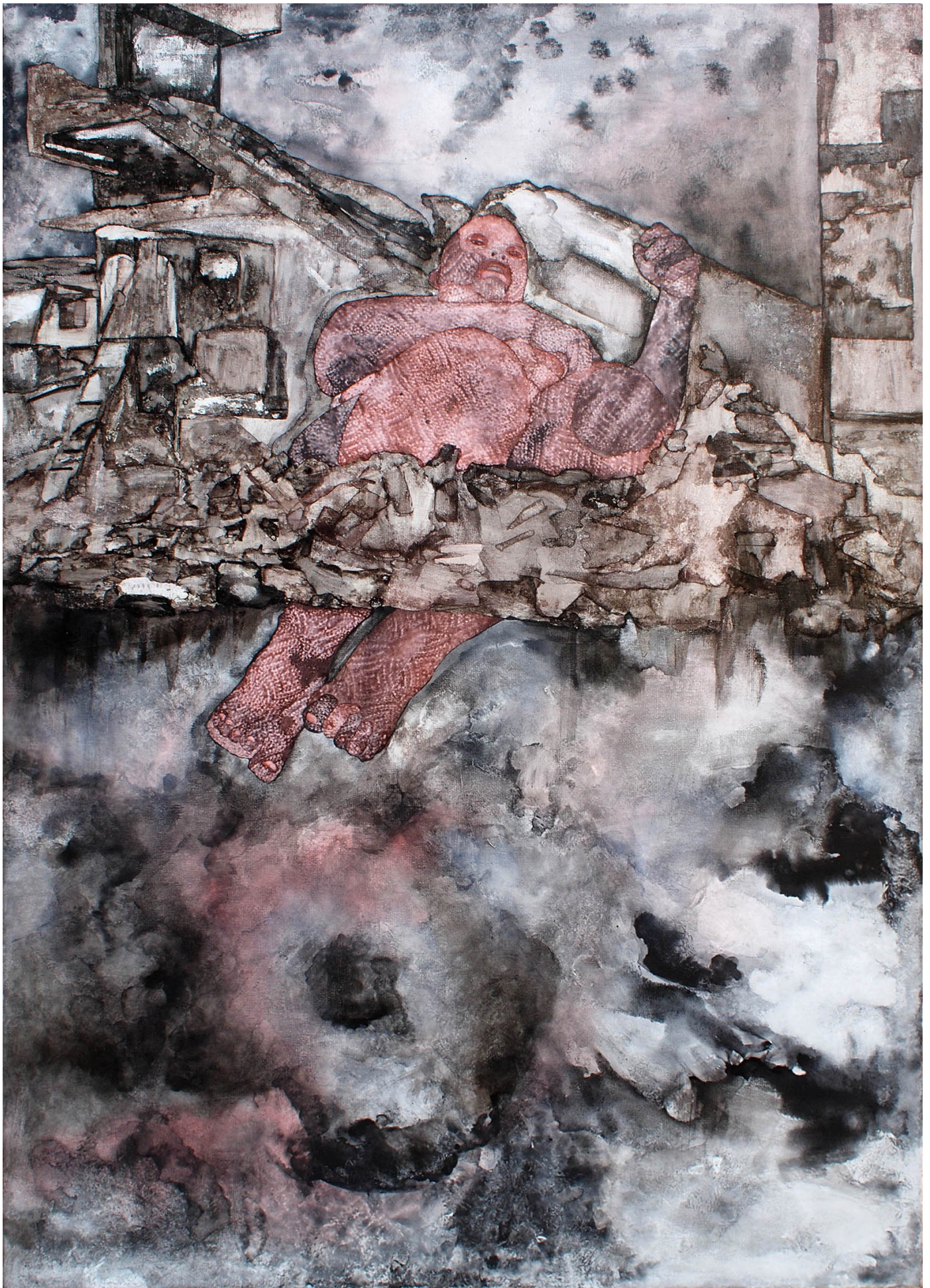
Consumed depicts a figure clinging to life amid rubble