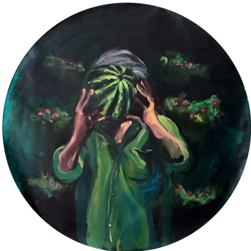
Yassine Balbzioui "Green Sight" (98cm / 38 5/8in)

WILD GARDENS Yassine Balbzioui Private View: Wednesday 4th September 6:30-9PM 5th of September – 5th of October 2019 Kristin Hjellegjerde Gallery 533 Old York Road, London SW18 1TG