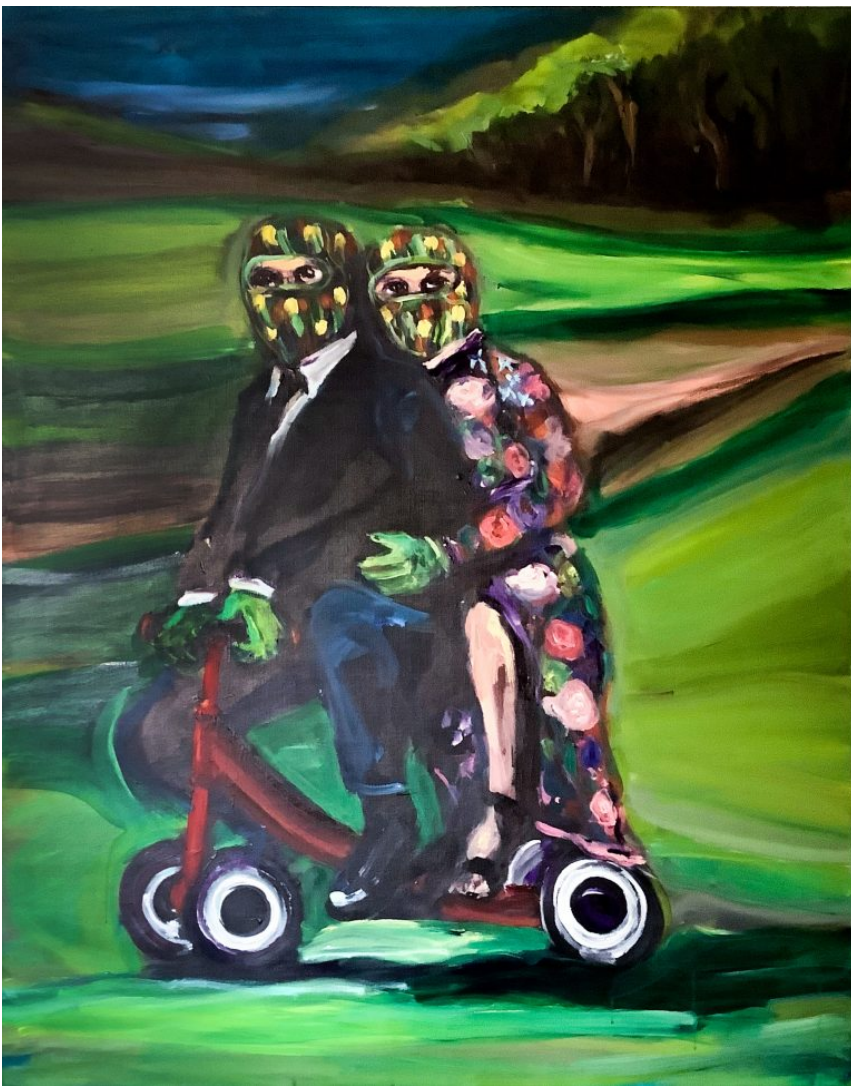
Yassine Balbzioui "Mystery Ride" (145 x 115 cm / 57 1/8 x 45 1/4in)

Mystery is at the centre of Balbzioui's artistic practise; each painting is layered with narrative possibility, provoking the viewer to continue the creative process with their own imagination. Balbzioui typically works from an archive of collected images, film stills, travel photography and portraits that he takes of subjects wearing costumes and masks. 'The mask is a way of protecting the self, but it is also a tool for performance and play,' commented the artist. Notably, all of the figures in this latest body of work are either wearing masks that reveal only their eyes, or appear to be hiding behind various objects. The effect is as humorous as it is disconcerting. 'Bad Disguise', for example, depicts a figure wearing a tutu skirt and what looks like swimming goggles, an image that is imbued with innocent childhood theatrics, whilst the recurring figures of masked suited men possess darker undertones.