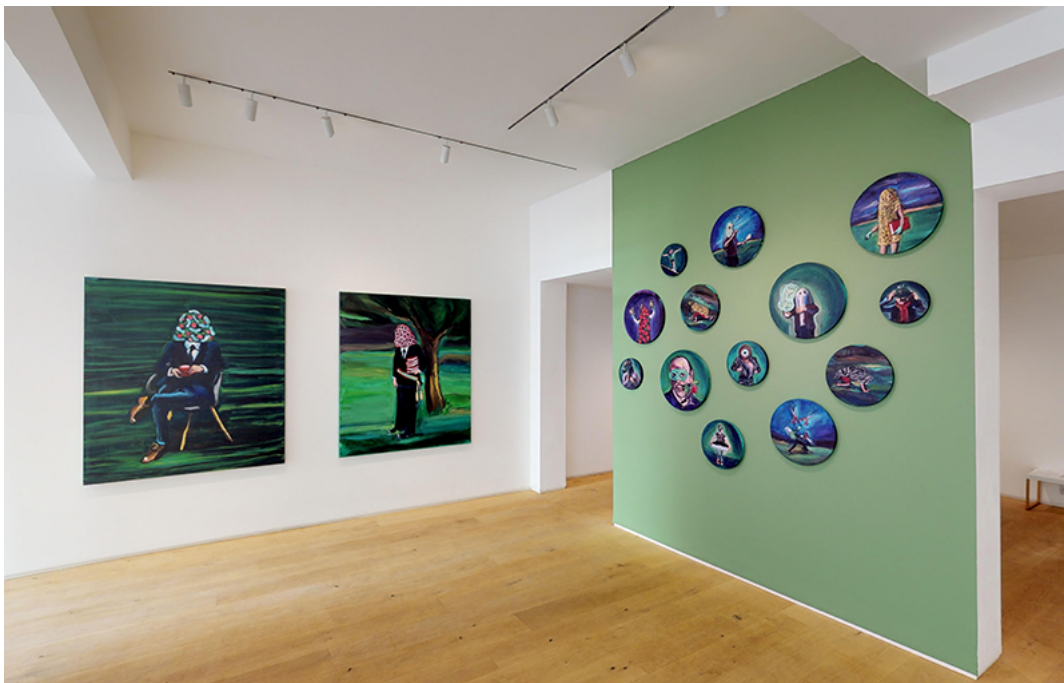
Wild Gardens. Yassine Balzioui. Kristin Hjellegjerde, London

Take us through your curatorial process. What do you look for when you review artists for a show?