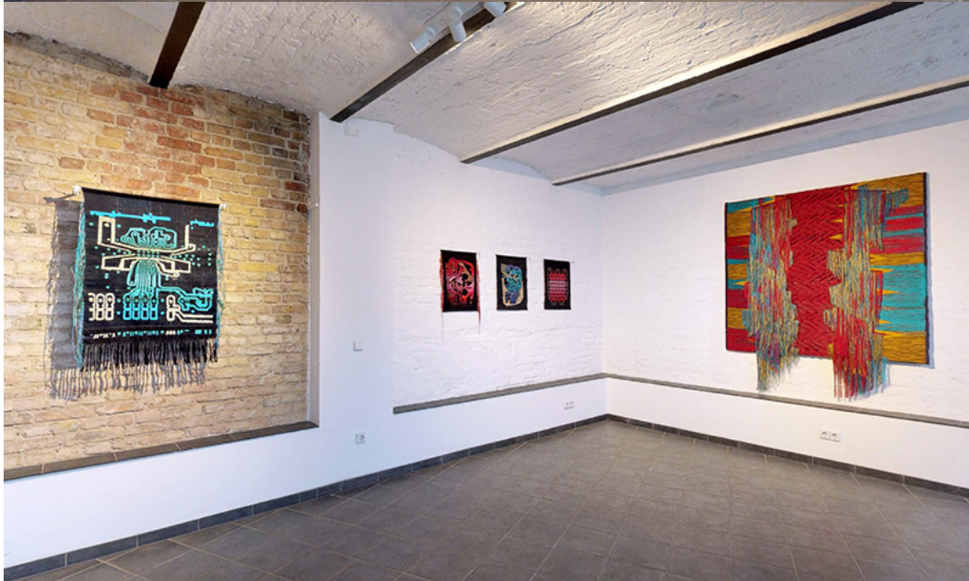
Strangers In Town Group Exhibition. Kristin Hjellegjerde, Berlin.

How do you deal with the conceptual difficulty and uncertainty of creating something completely new with every exhibition?