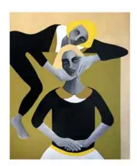
REBECCA BRODSKIS, EGLA AND BATSHEVA, 2020