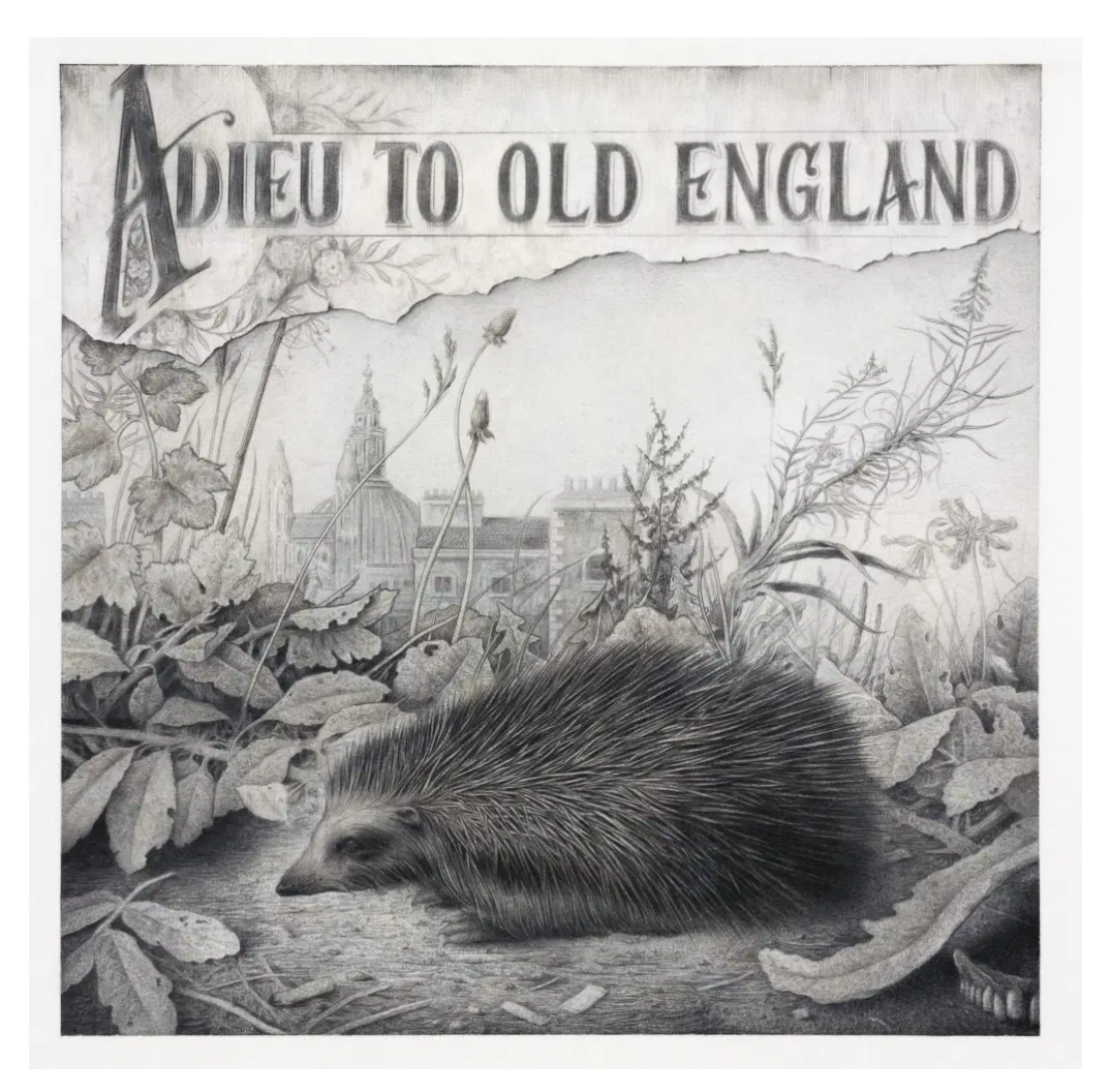
Sverre Malling – Adieu to Old England, 2020, Charcoal and pencil on paper, 76 x \, 57cm