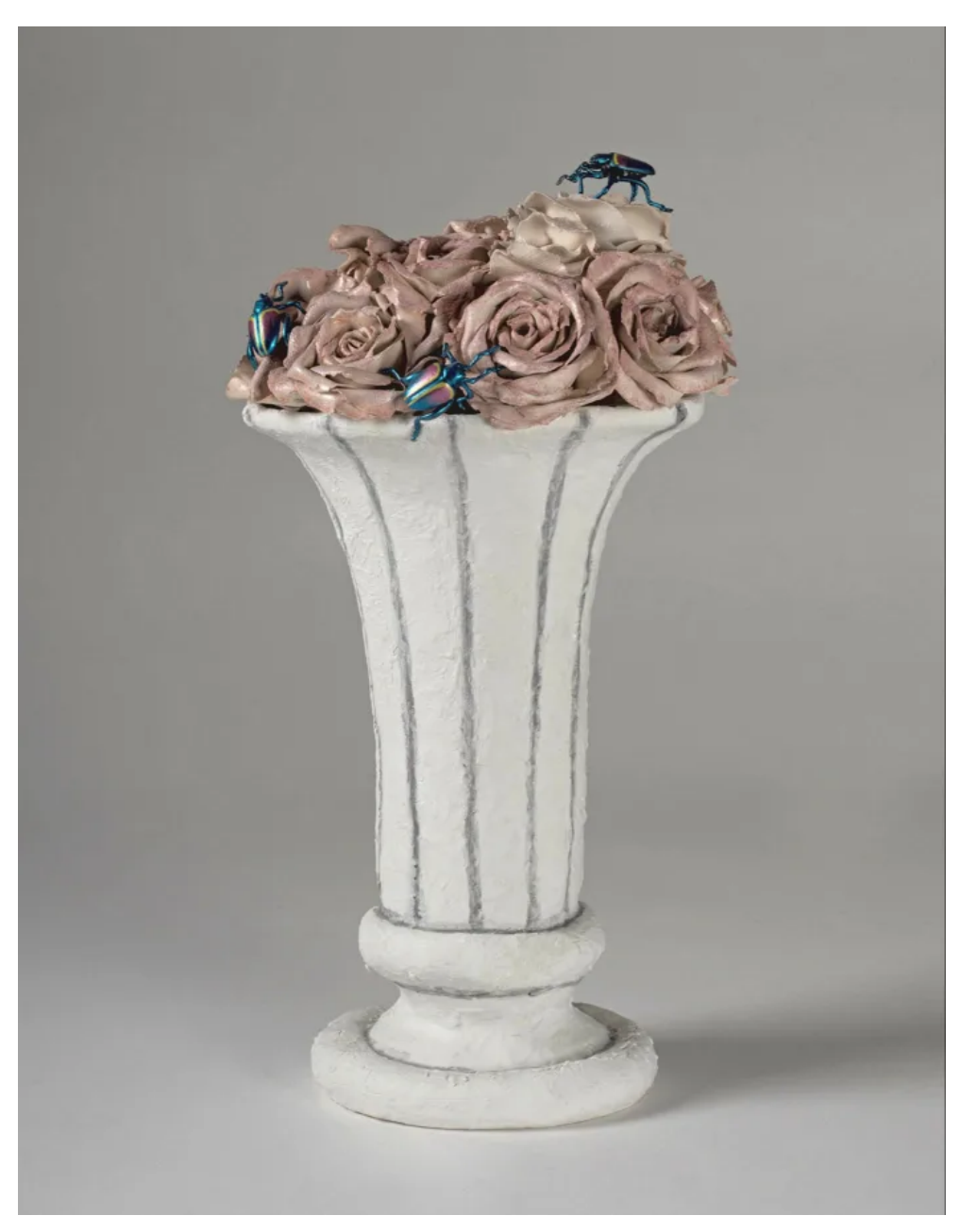
'Per Morandi' (2020) by Bertozzi & Casoni at Galleria d'Arte Maggiore g.a.m

Crucially, the fair acts as a gateway to the Asian market, says Luigi Mazzoleni of Mazzoleni gallery which is showing a selection of works by Agostino Bonalumi and Getulio Alviani (prices range from $100,000 to $300,000) on the "Italians" stand, and paintings by Morandi, Giorgio de Chirico and Salvo (Salvatore Mangione) in the parallel Art Basel Hong Kong online viewing room. The other galleries involved in "Italians" are Alfonso Artiaco, Galleria Continua and Galleria Franco Noero.