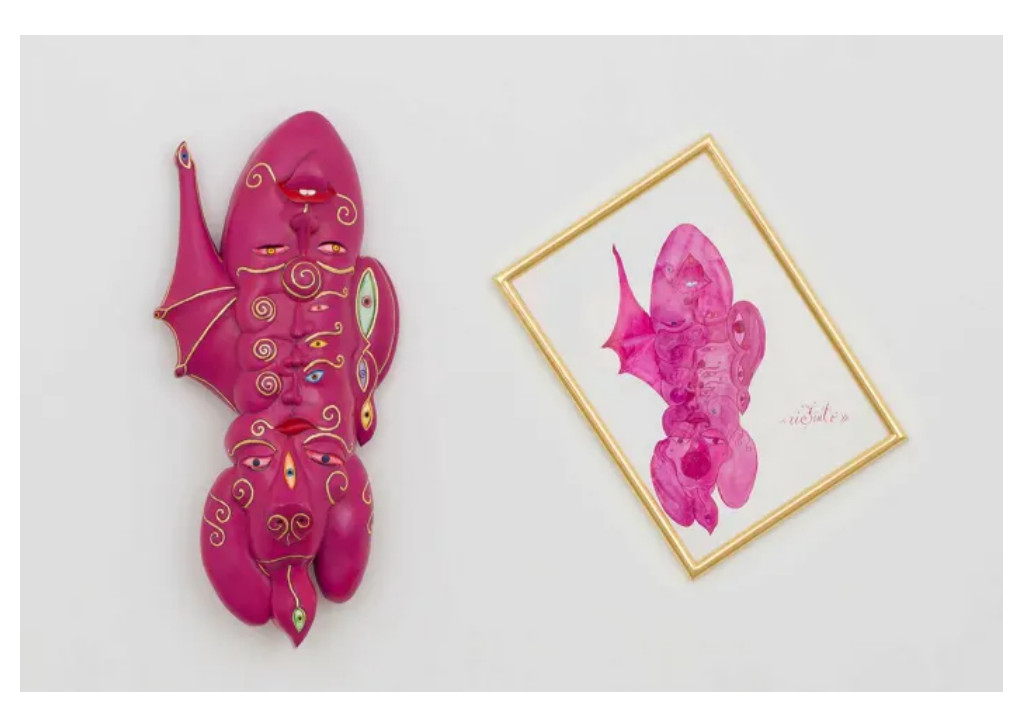
'Rifiuto' (2014) by Luigi Ontani at Massimo De Carlo gallery

exhibiting photographs by Turin-born Elisa Sighicelli and paintings by Vittoria Chierici including "Gruppo di Plotino", 2021 (prices undisclosed).