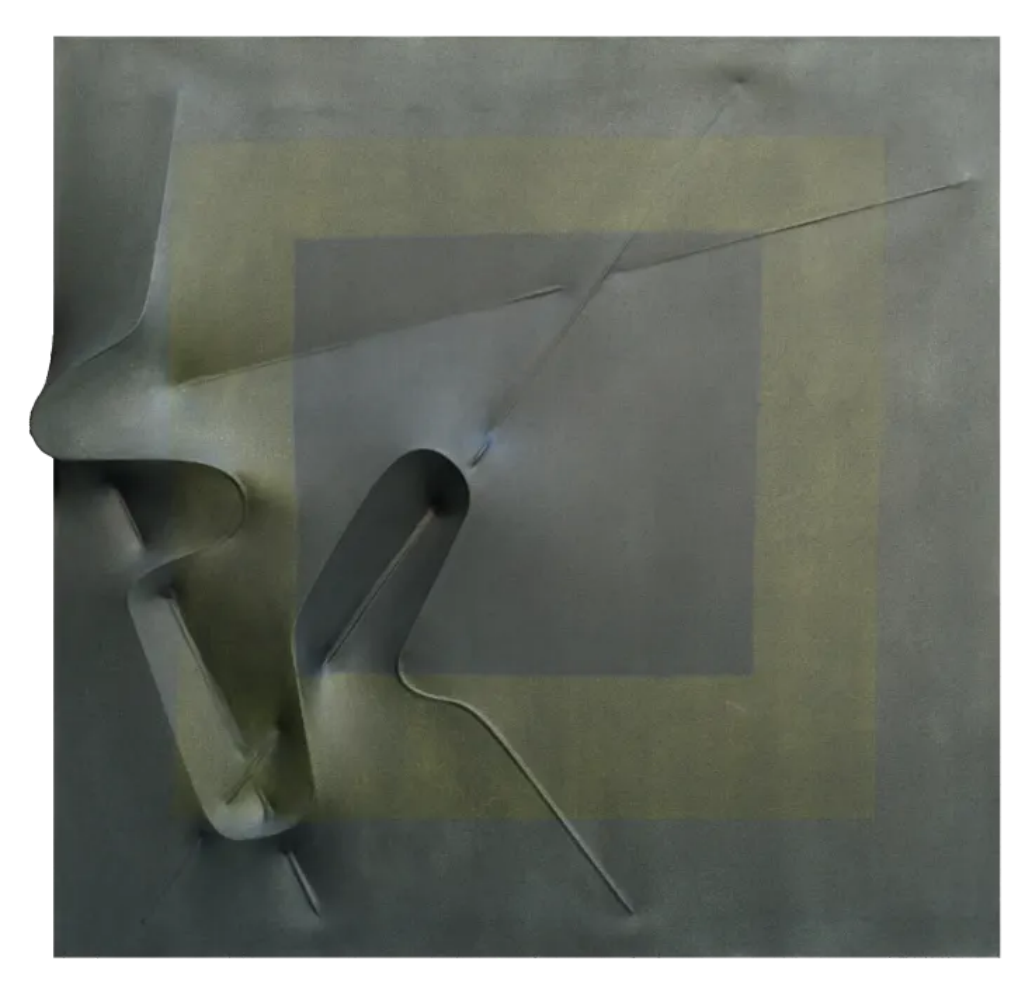
'Verde' (2002) by Agostino Bonalumi at Mazzoleni gallery

The project — part of a wider cultural programme in Hong Kong and Macau called "Italian Style" — is a masterstroke of cultural diplomacy. Fossati emphasises that the Italian Cultural Institute is an office of the Italian Ministry of Foreign Affairs in China; €150m has been set aside by the Italian government to "support companies in their international activities", he says. "Art galleries are private companies that play an important role in promoting Italian culture."