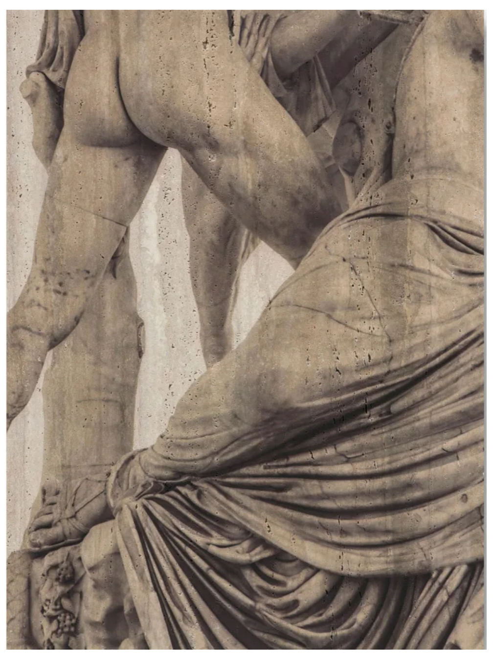
'Untitled (9015)' (2019) by Elisa Sighicelli at Rossi & Rossi gallery © Courtesy of Rossi & Rossi and the artist.