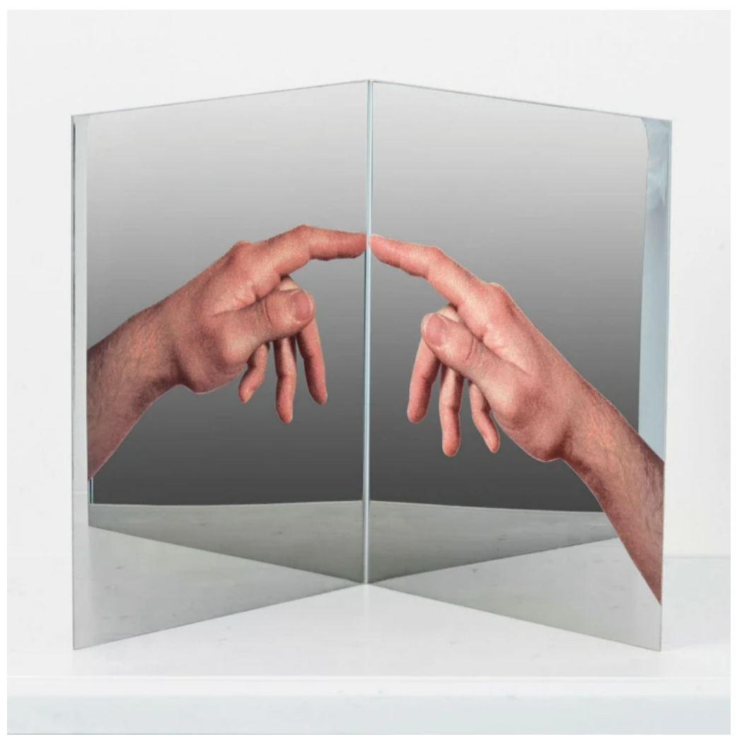
© 'ConTatto' (2017) by Michelangelo Pistoletto | Courtesy of the artist and Galleria Continua. Photo: Ela Bialkowska

A collective booth of leading Italian dealers is among the galleries participating remotely at Art Basel Hong Kong this year