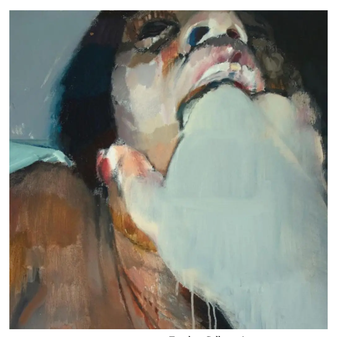
Touch at Gallery 46

<u>Gallery 46</u> is found at 46 Ashfield Street, London E1. The show ends on September 9th, there is a late opening that night, more details via the gallery website