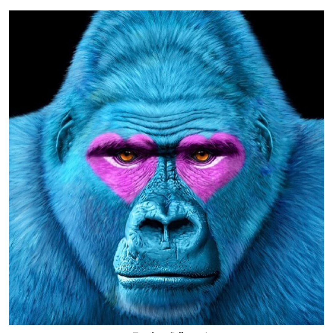
Touch at Gallery 46

Did we really see a group of artists crowing about a show they're doing at the News International building down by the Shard?! The News building! The Sun, Murdoch?! Really! Is there no shame? Aren't we artists obliged to give a shit?