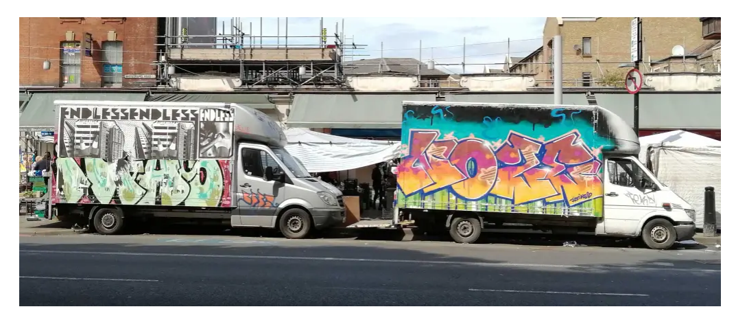
Whitelchapel, East London. August 2021