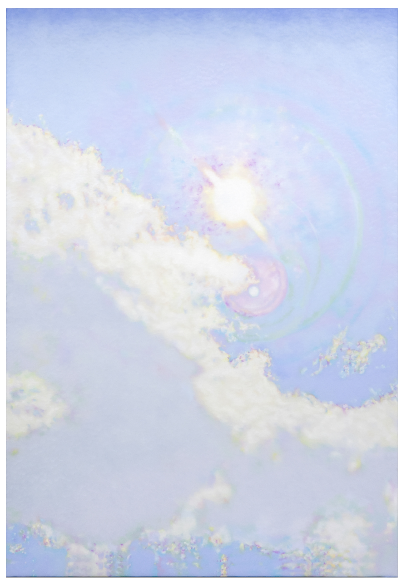
Martine Poppe, Almost at the top, 2021, oil on polyester restoration fabric, 160 x 110 cm