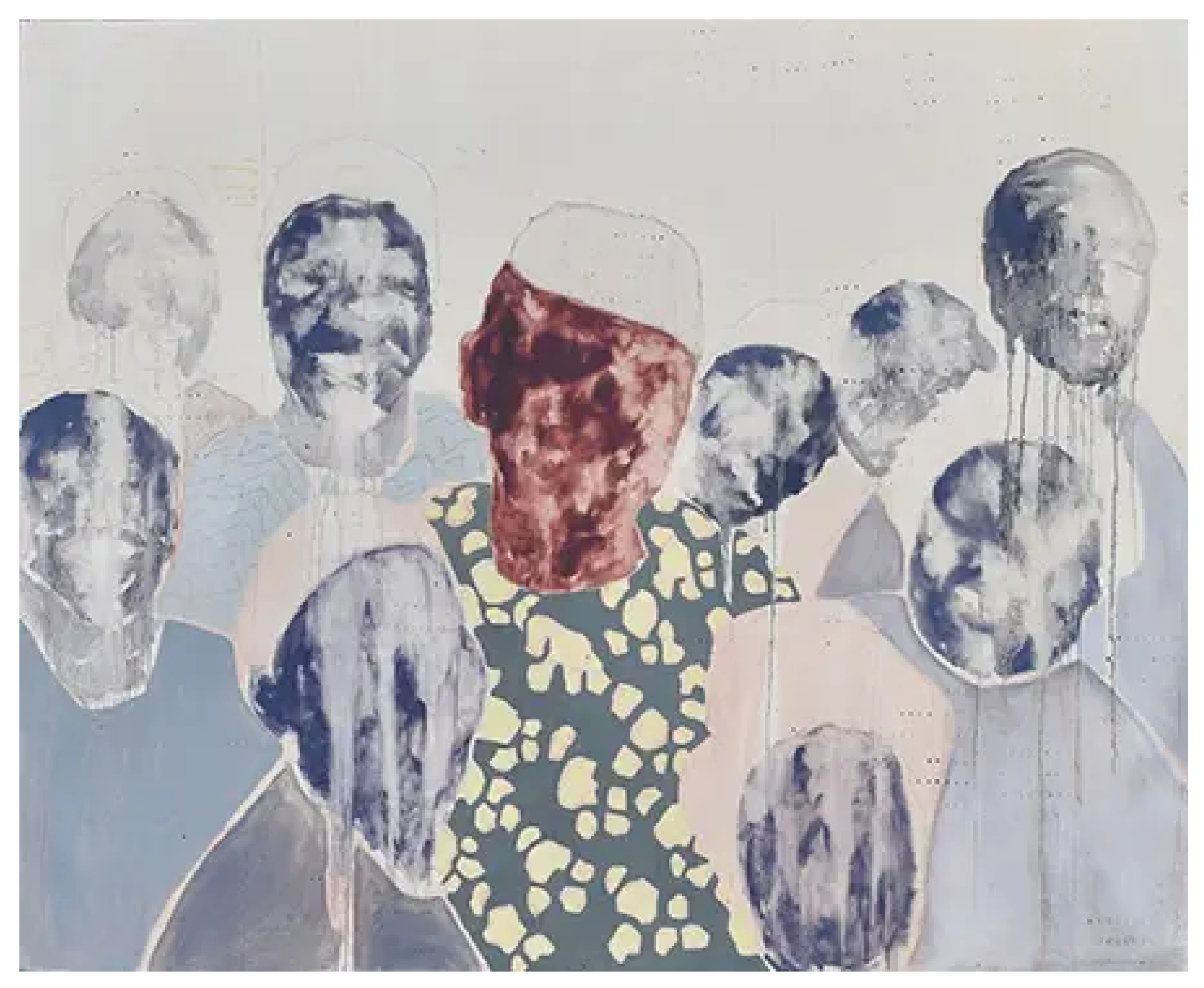
Flower power, 2020, oil on sanyan, 90 x 110 cm

Yes, absolutely. I want the work to be relatable. It's about the experience of being human – that's really what's at the heart of it. The qualities of being human, in spite of race or nationality or whatever. Of course, I am painting from the perspective of a black woman but I still really want to touch other people's lives, for them to be able to feel and relate to the work.