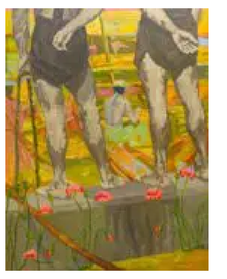
Routes of Life, Ghosts of History