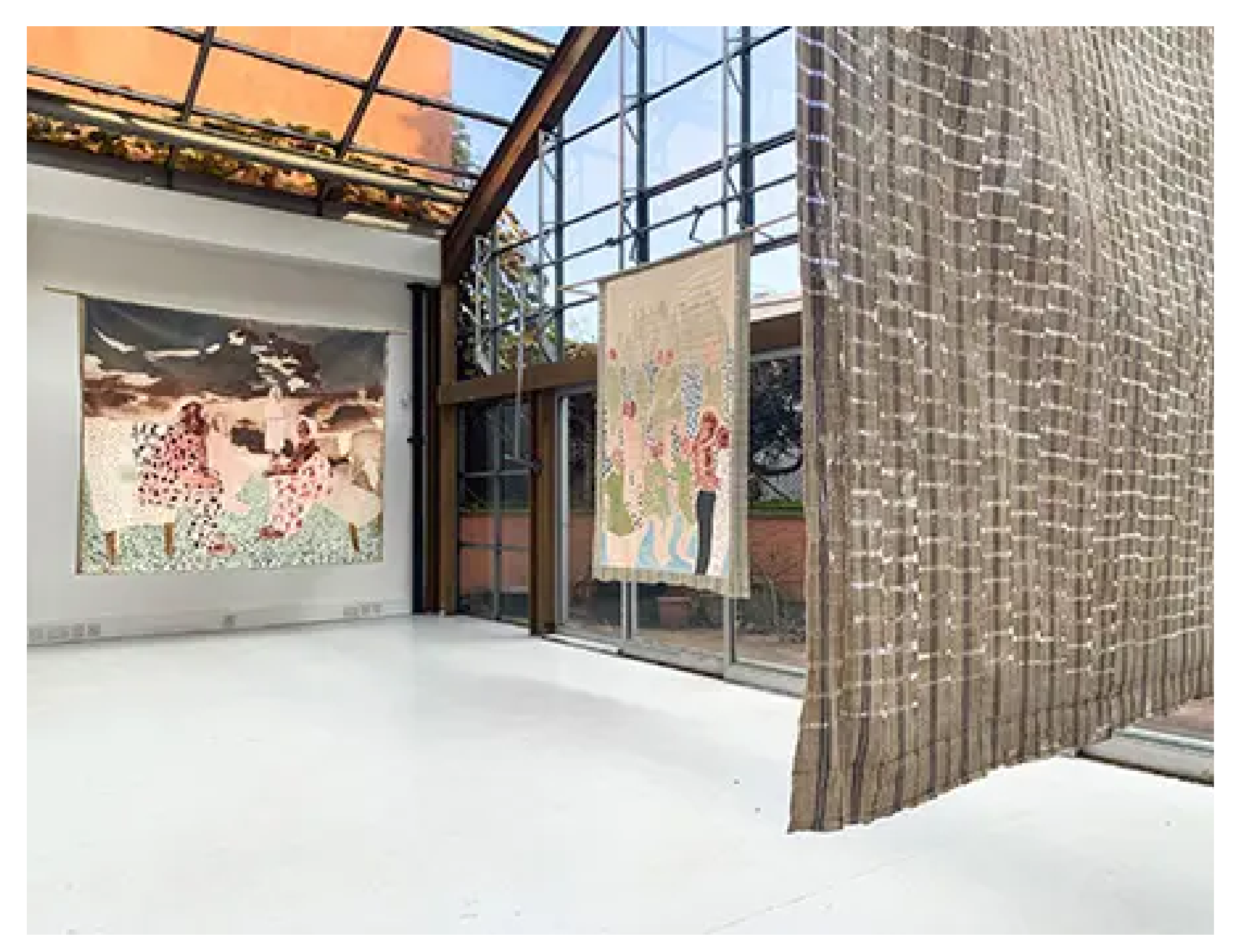
Installation view of Gathering

to become the body of the work, and it has changed the way I paint because it's a very rough surface. My brush marks are much looser and my style has adjusted.